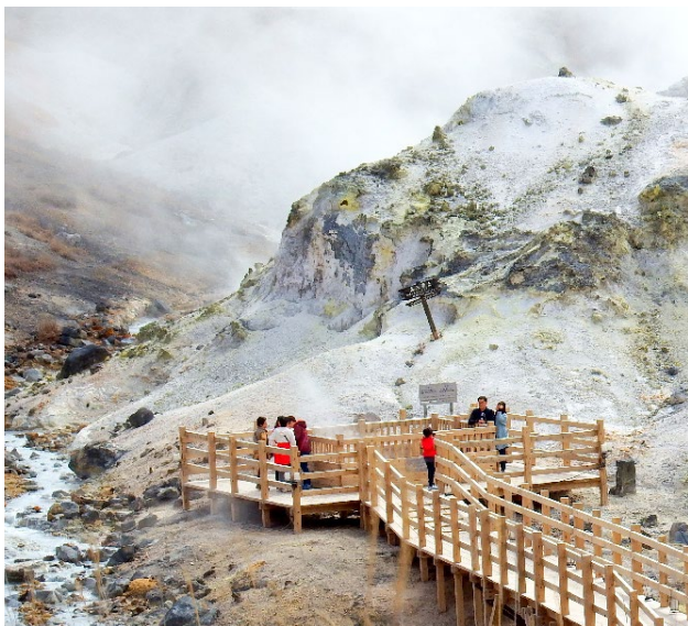
Jigokudani | 地狱谷