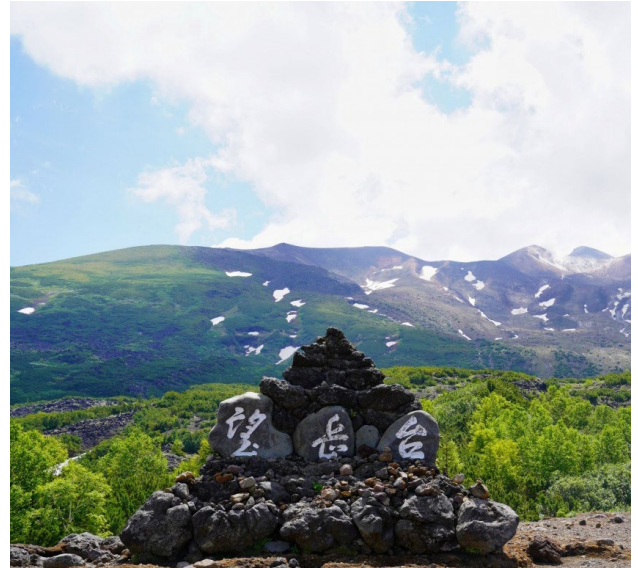
Tokachidake Observatory | 十胜岳望岳台