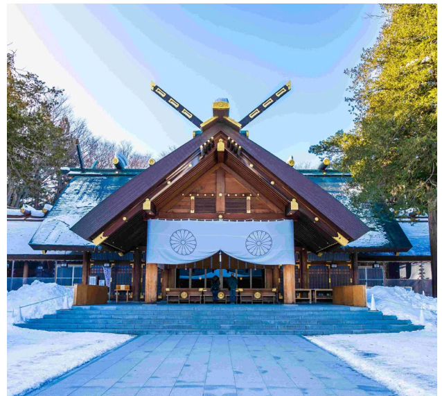
Hokkaido Jingu Shrine | 古老北海道神宮