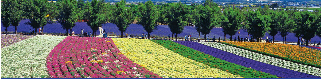
Farm Tomita | 富田农场