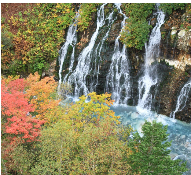
Shirahige Waterfall | 白须瀑布