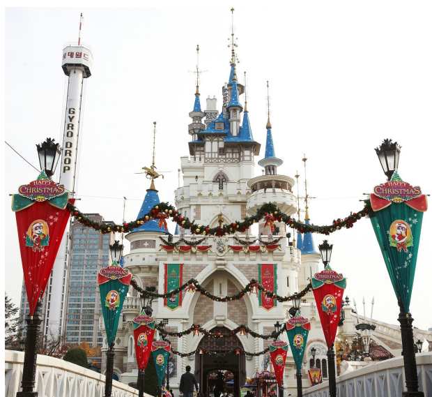
Lotte World Adventure Park | 乐天世界