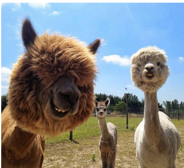
Alpaca World Park | 羊驼世界公园