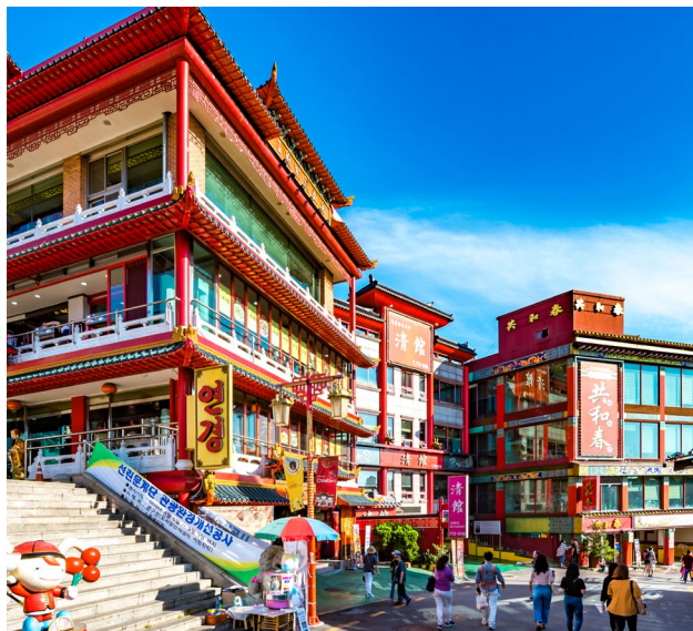
Incheon Chinatown | 唐人街