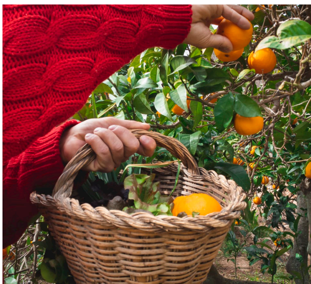
Tangerine Farm | 橘子农场