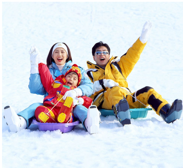
Snow Activities | 雪上活动