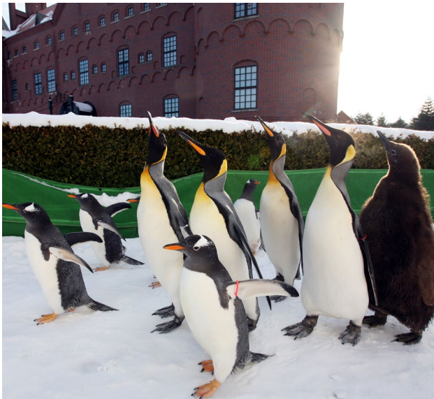
Noboribetsu Marine Park | 登別海洋公園