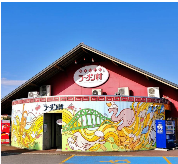
Asahikawa Ramen Village | 旭川拉面村