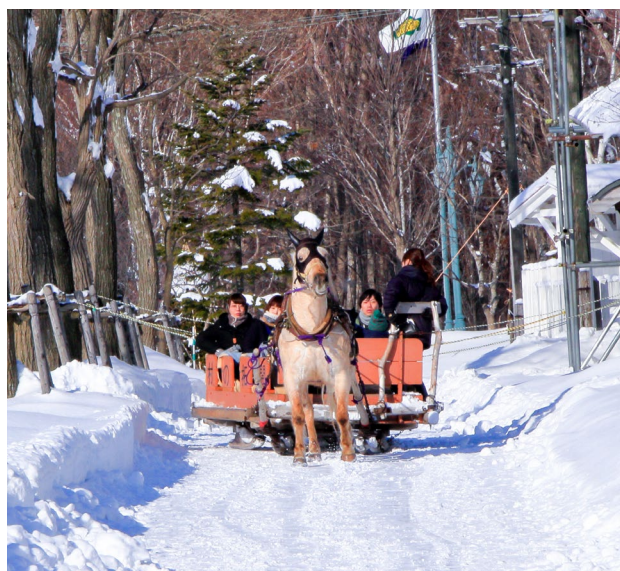
Northern Horse Park | 北国马场主题公园