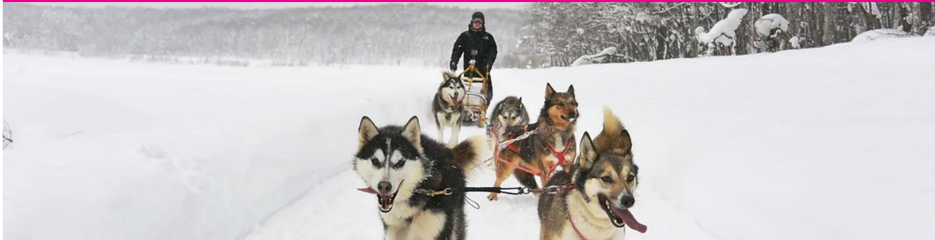
Dog Sledding | 狗拉雪橇体验