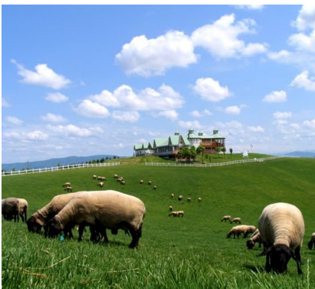
Shibetsu World Sheep Farm | 士別世界羊场