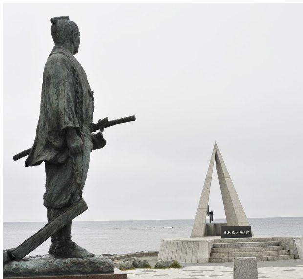
Statue of Mamiya Rinzo | 间宫林藏雕立像