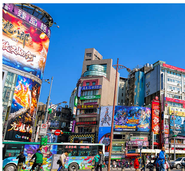
Ximending | 西门町