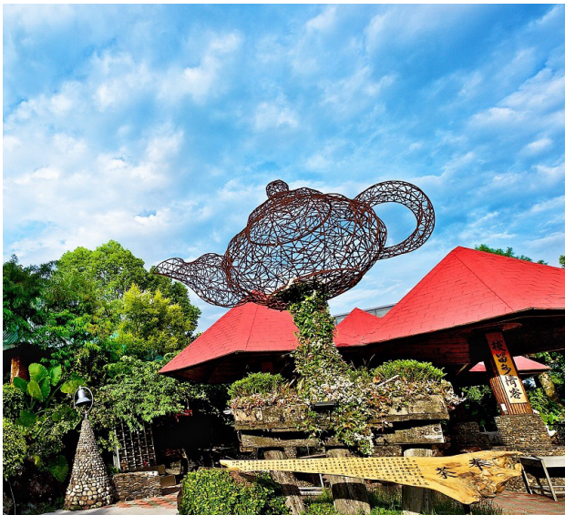
Shangri-La Leisure Farm | 香格里拉休闲农场