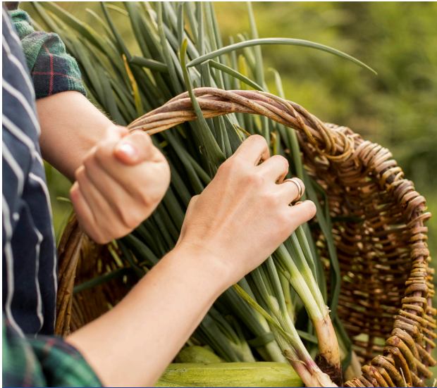
Yilan Baby Green Onion Experience Farm | 宜兰三星葱