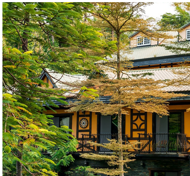
Dakeng Leisure Farm | 大坑休闲农场