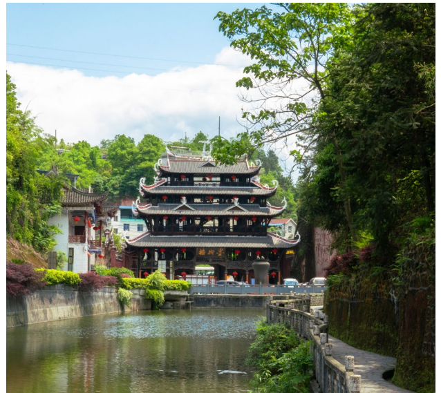
Enshi Tujia Daughters' Town | 恩施土家女儿城