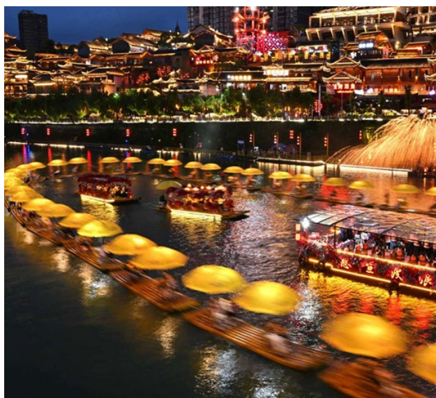
Xuan'en Night View | 宣恩夜景

Accommodation: Ramada Plaza Hotel or similar