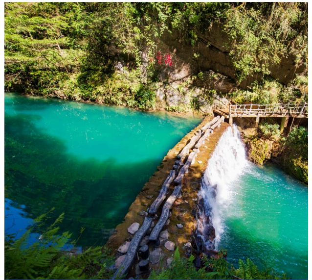
Pingshan Grand Canyon | 屏山大峡谷