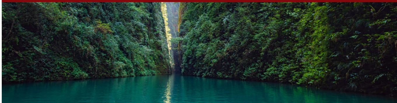
Pingshan Grand Canyon | 屏山大峡谷