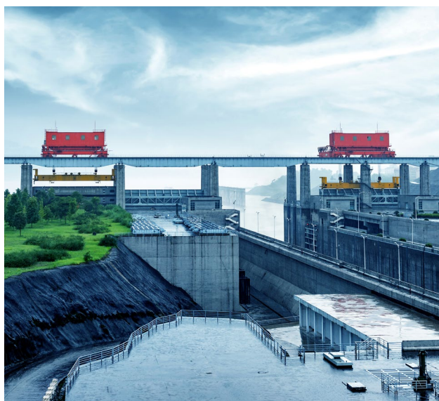
Three Gorges Dam | 三峡大坝

Accommodation: Taohualing Hotel Yichang or similar