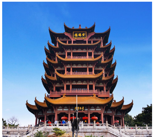
Yellow Crane Tower | 黄鹤楼