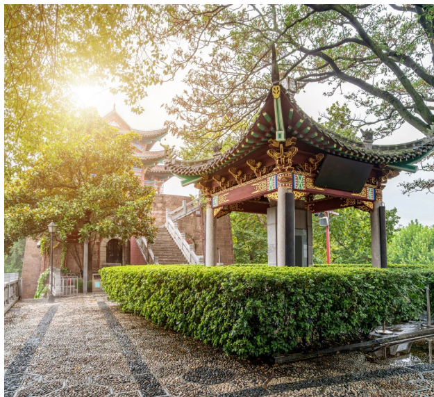
Qingchuan Pavilion | 晴川阁