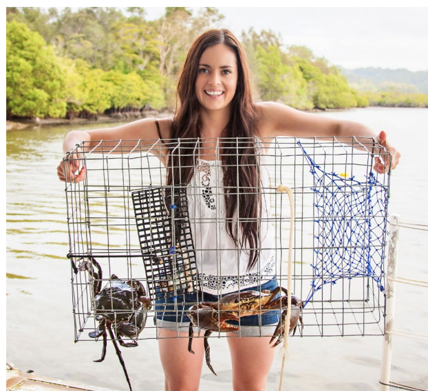
Catch a Crab Tour