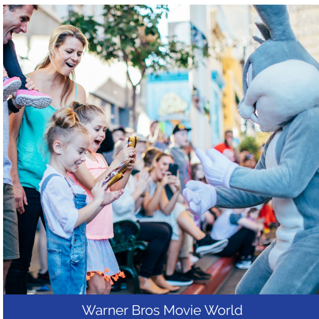
Warner Bros Movie World