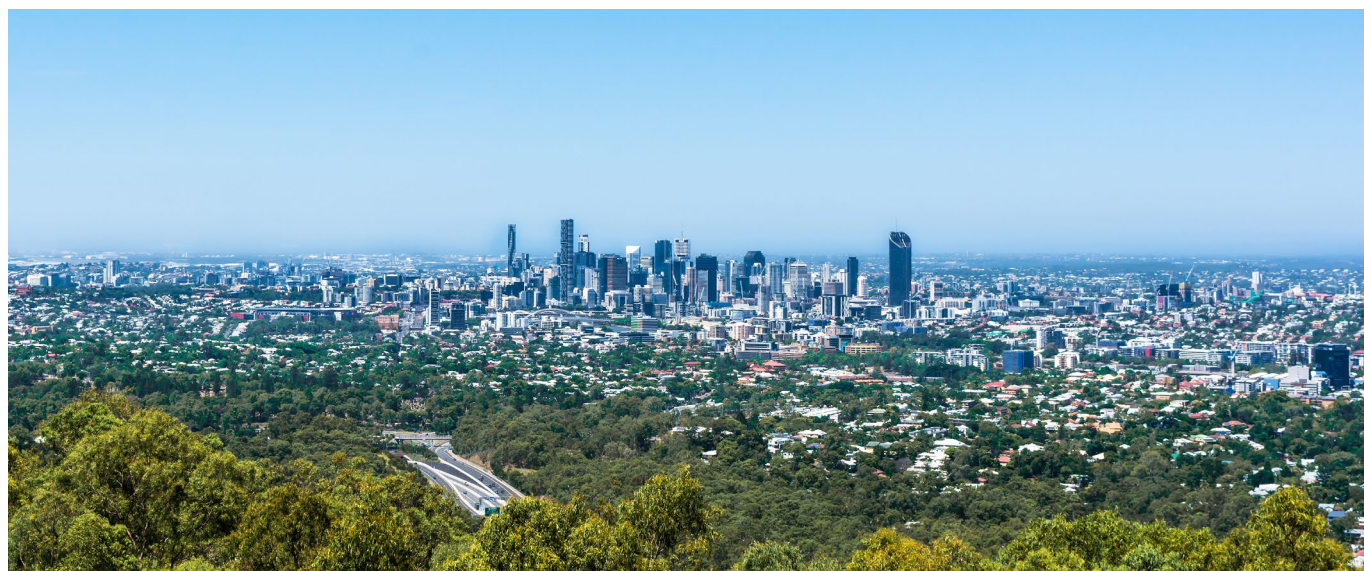
Mt. Coot-tha Lookout Point View