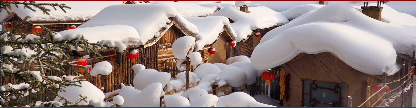
Snow Town Scenic Area | 雪乡旅游风景区