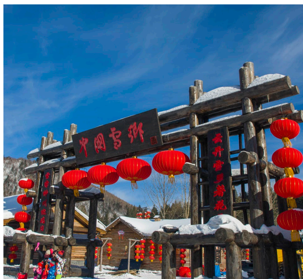
Snow Rhythm Street | 雪韵大街