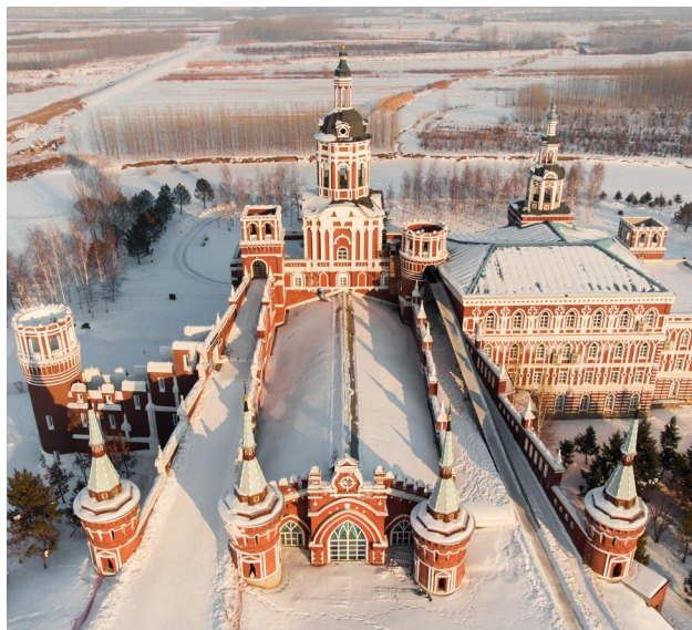
Volga Manor | 伏尔加庄园