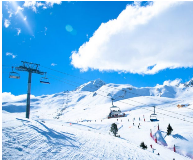
Yabuli International Ski Resort | 亚布力国际滑雪场