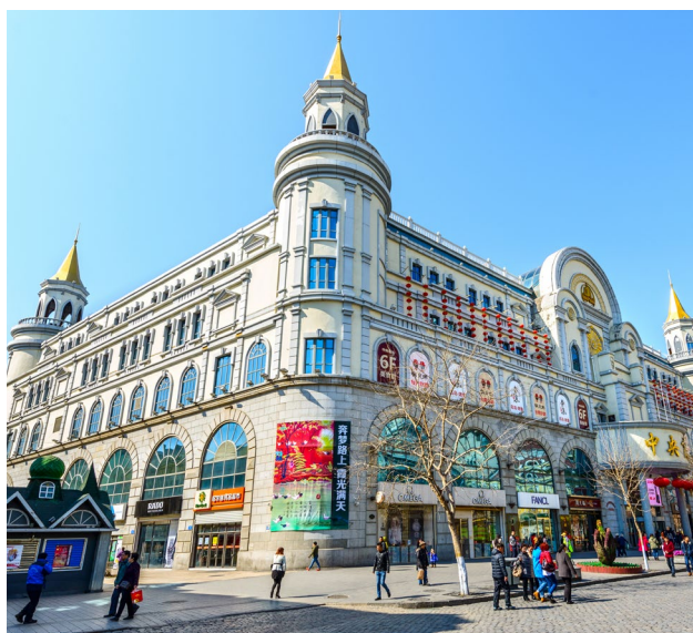
Harbin Central Street | 哈尔滨中央大街