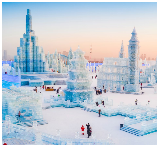
Harbin Ice and Snow World | 哈尔滨冰雪大世界