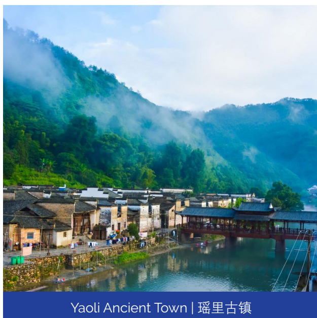
Yaoli Ancient Town | 瑶里古镇