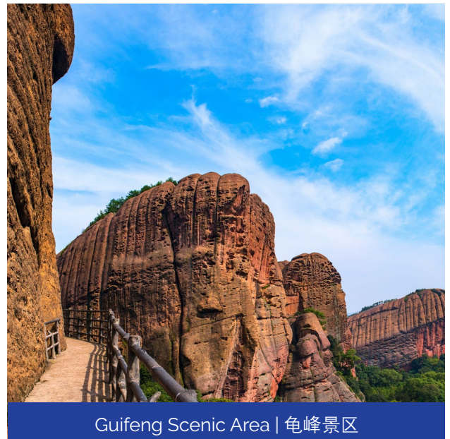
Guifeng Scenic Area | 龟峰景区