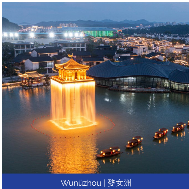
Wunüzhong | 婺女洲