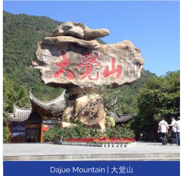
Dajue Mountain | 大觉山