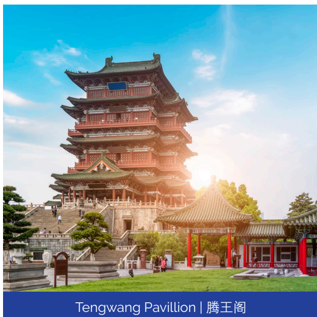
Tengwang Pavillion | 滕王阁