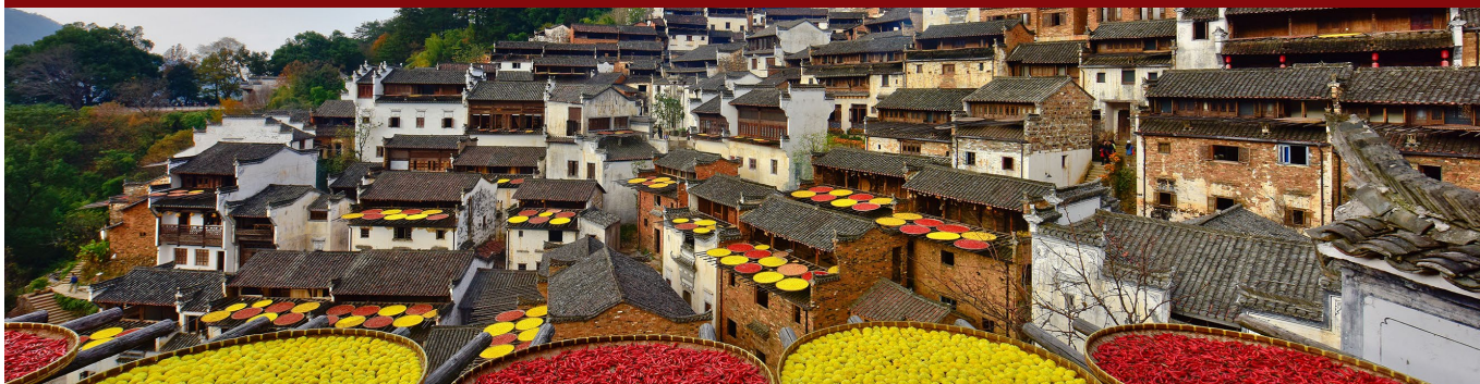
Huangling Scenic Area | 篁岭景区