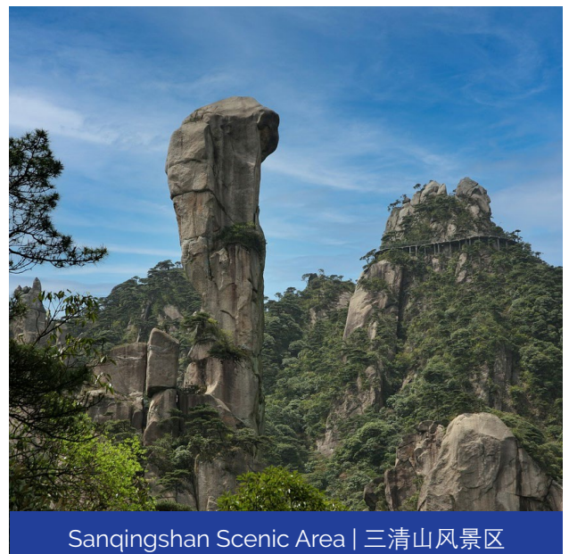
Sanqingshan Scenic Area | 三清山风景区