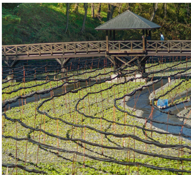
Wasabi Farm | 芥末农场