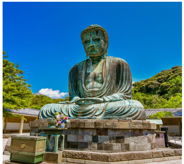
Great Buddha of Kamakura | 鎌倉大佛