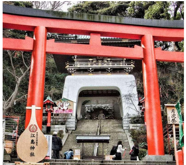
Enoshima Shrine | 江島神社