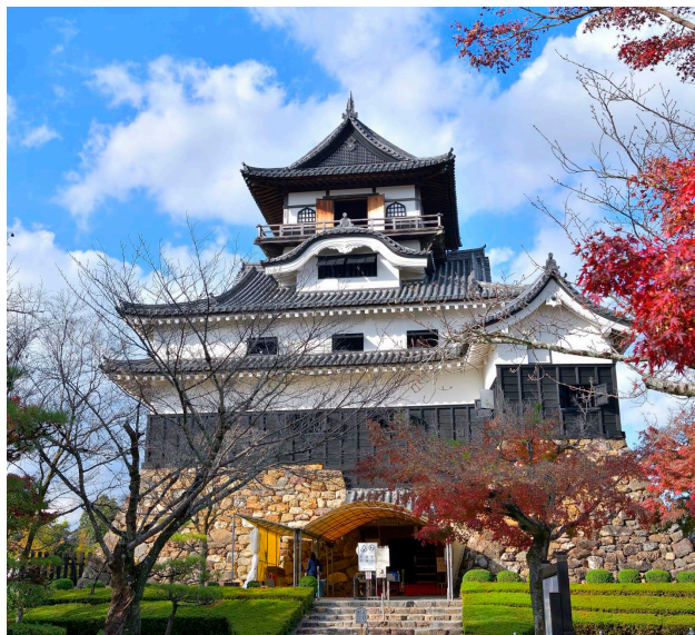
Inuyama Castle | 犬山城