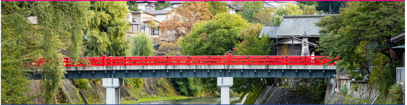
Hida Takayama Mountains | 飞騨高山