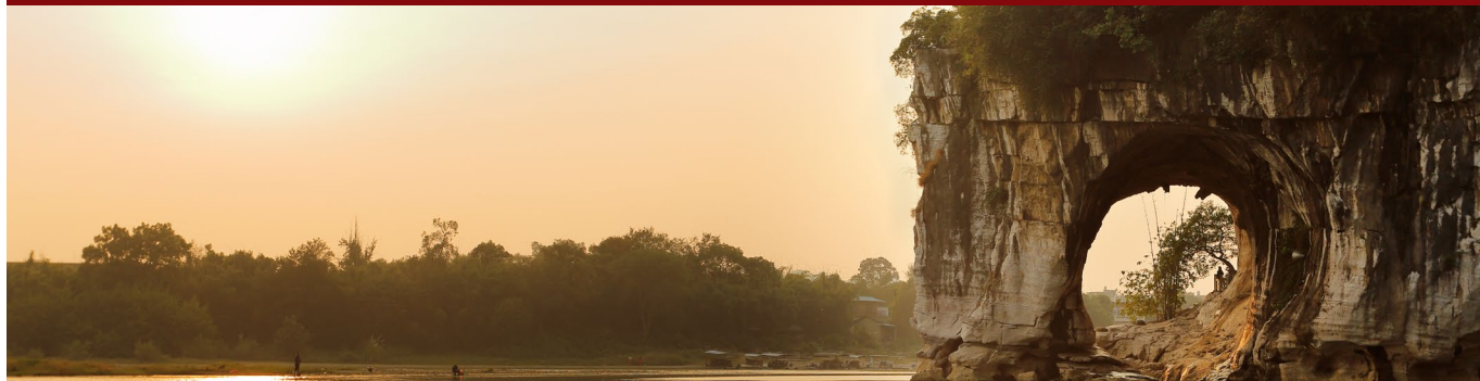
Elephant Trunk Hill Park | 象鼻山公园