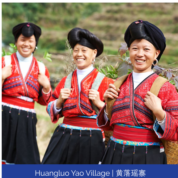
Huangluo Yao Village | 黄落瑶寨