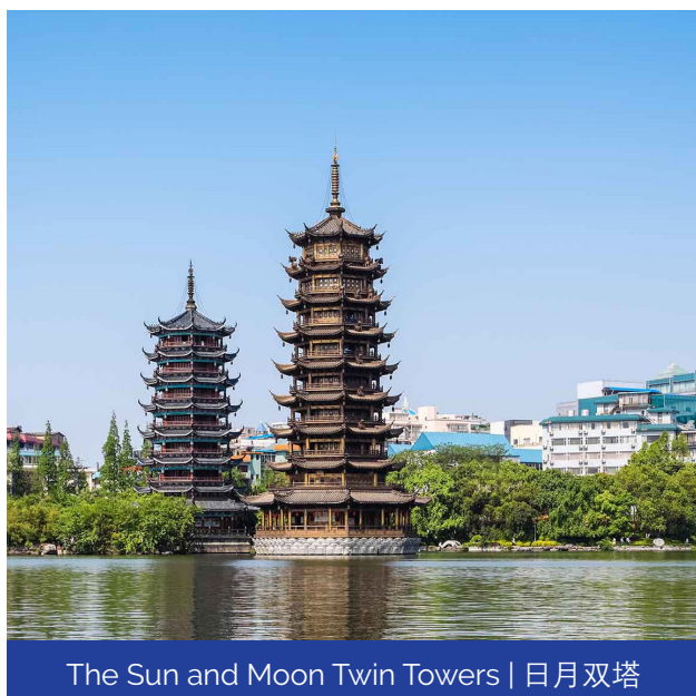
The Sun and Moon Twin Towers | 日月双塔