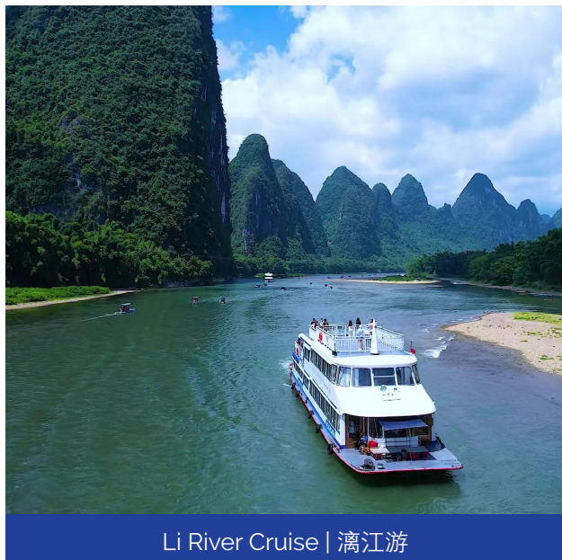
Li River Cruise | 漓江游