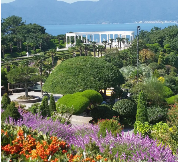
Oedo Botania | 海上花园波塔尼亚