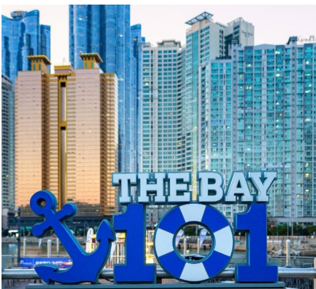
Bay 101 | 海湾101