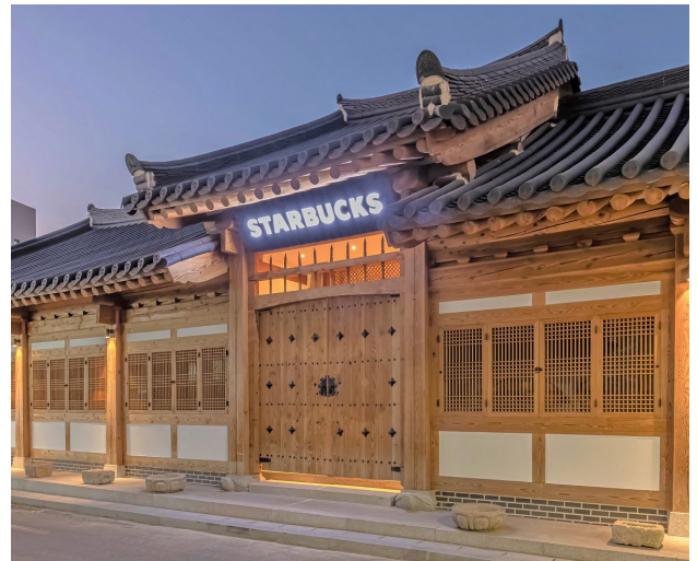
Daegu Hanok Starbucks Café | 大邱百年韩屋星巴克