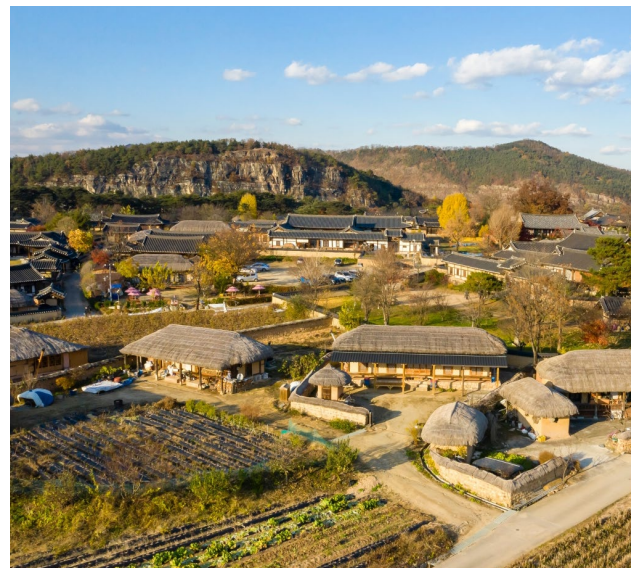
Andong Hahoe Folk Village | 安东河户民俗村