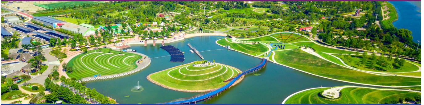
Gejeo Island | 巨济岛