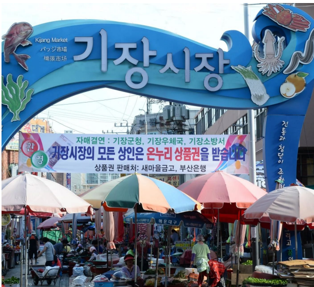
Gijang Market | 吉让市场