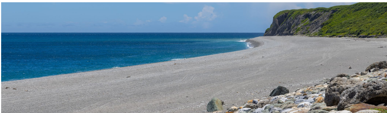
Qi Xing Lake | 七星潭