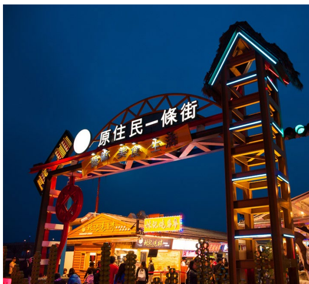
Dongdamen Night Market | 东大门夜市