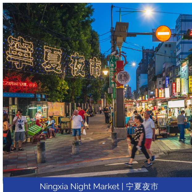
Ningxia Night Market | 宁夏夜市