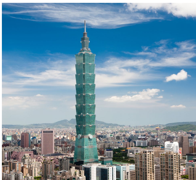
Taipei 101 World Building | 台北101