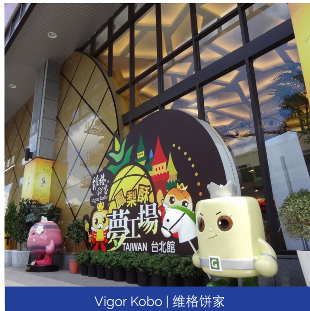
Vigor Kobo | 维格饼家