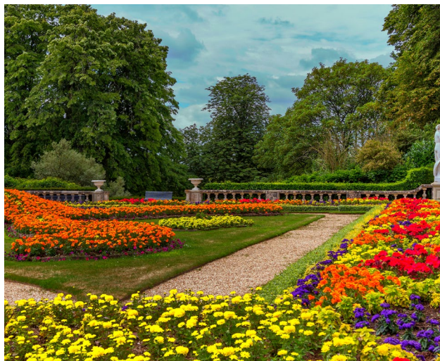
Lintianshan Forstry Culture Park | 林田山林业文化园区