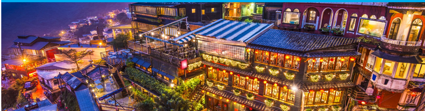
Chiufen | 九份