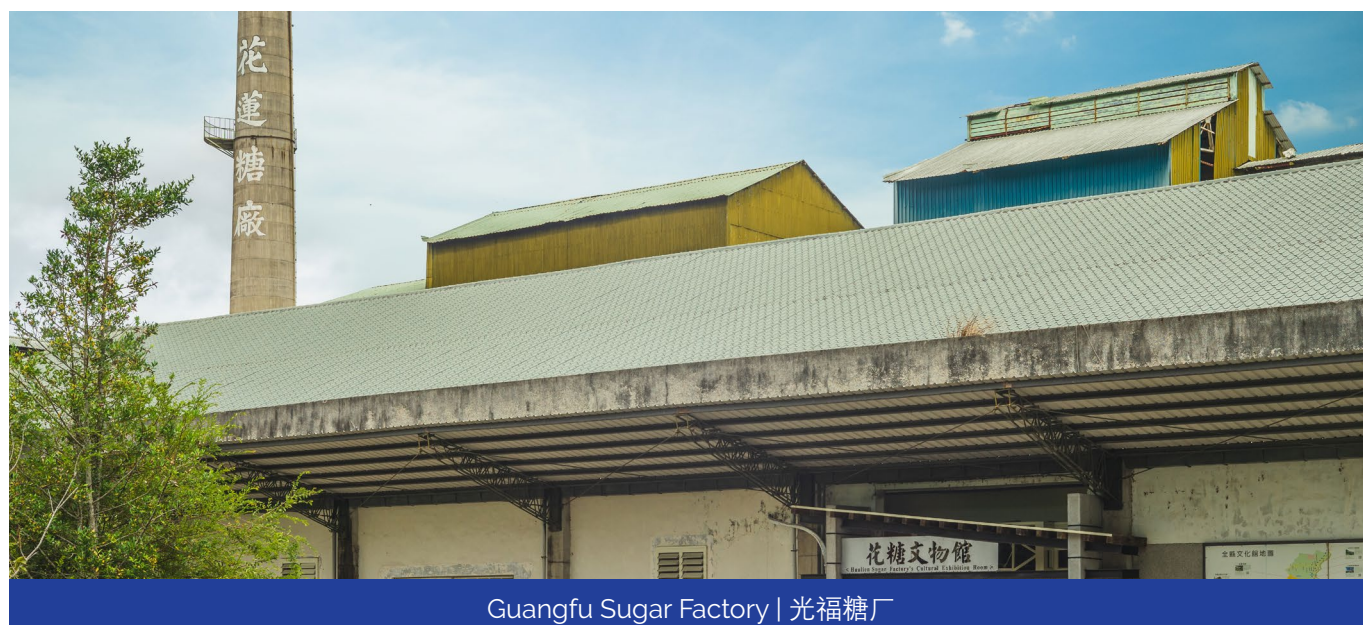
Guangfu Sugar Factory | 光福糖厂