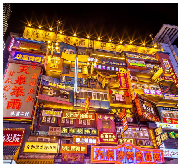
Pozi Street | 坡子街