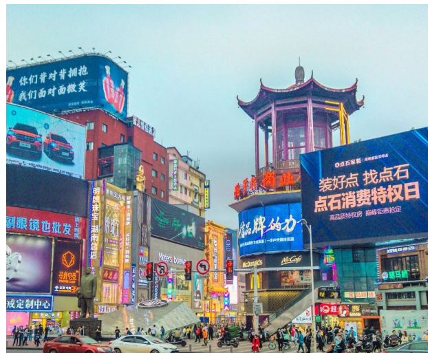
Huangxing Road Pedestrian Street | 黄兴路步行街