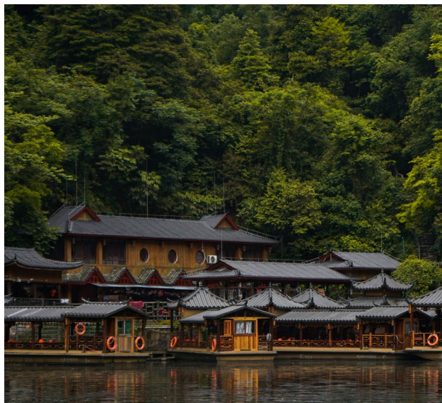
Baofeng Lake | 宝峰湖