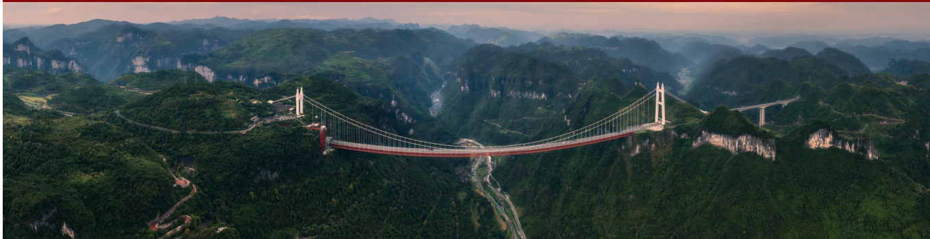
Aizhai Bridge | 矮寨大桥