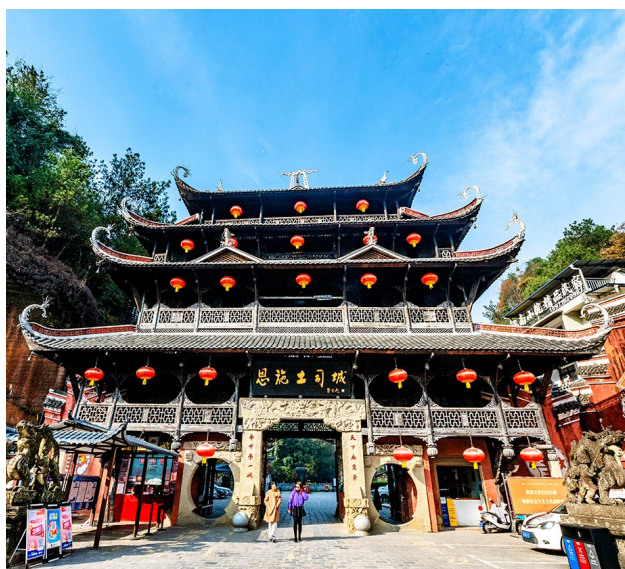
Tusi City | 土司城

Accommodation: Changde Yunxi Hotel or similar