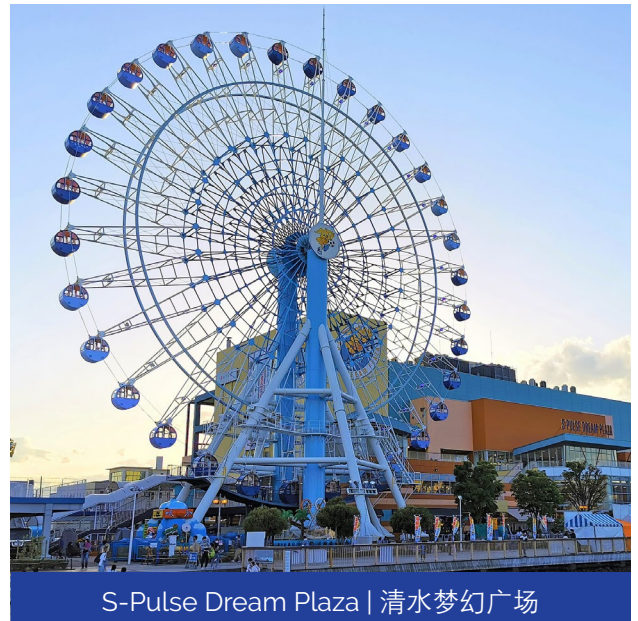
S-Pulse Dream Plaza | 清水梦幻广场