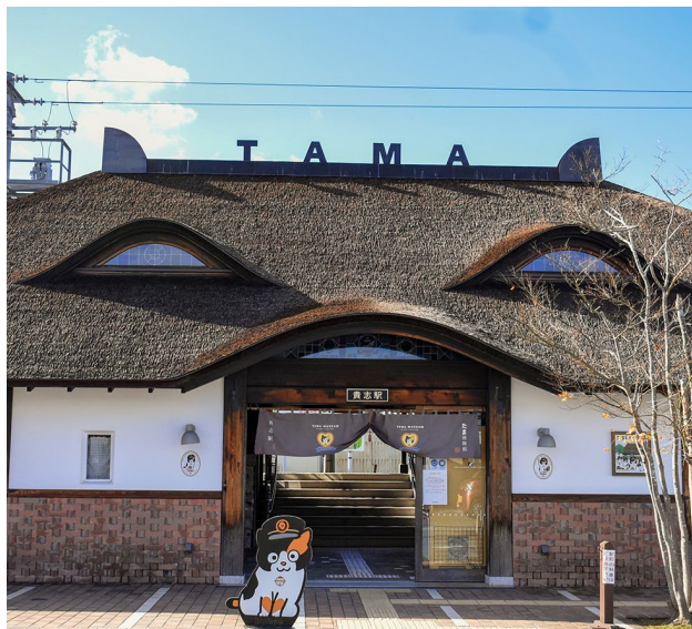
Tama Museum & Kishi Station | 多摩博物館和岸站