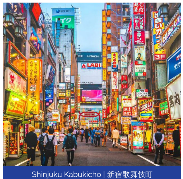
Shinjuku Kabukicho | 新宿歌舞伎町