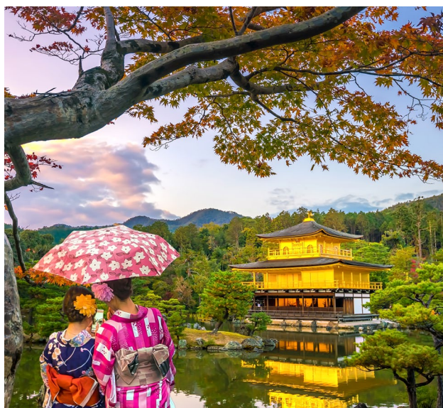
Kinkakuji | 金閣寺