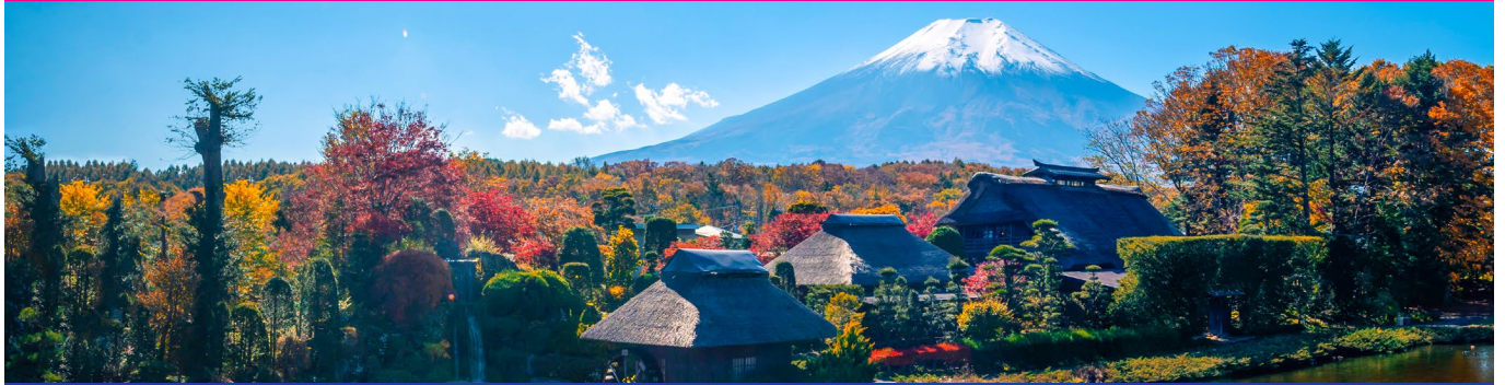
Oshino Hakkai Village | 忍野八海村