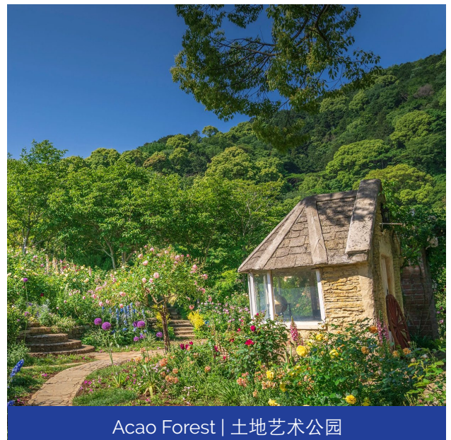
Acao Forest | 土地艺术公园