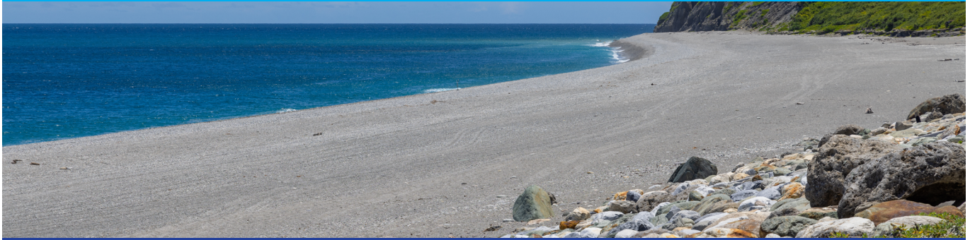
Qi Xing Lake | 七星潭