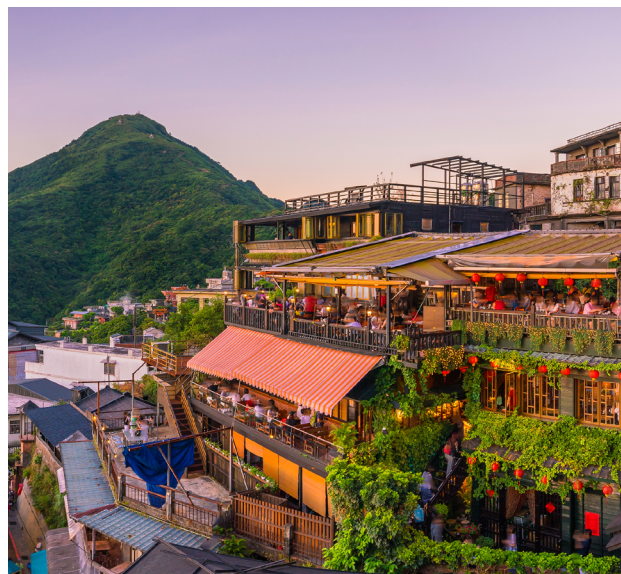
Chiufen | 九份