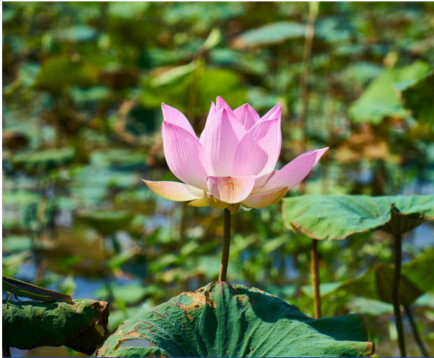
Matai'an Wetland Ecological Park | 花莲马泰安湿地