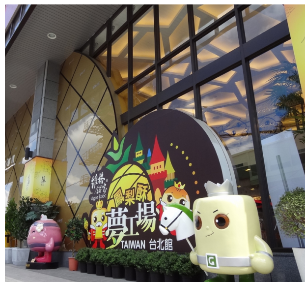
Vigor Kobo | 维格饼家