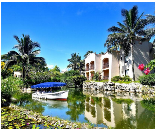
Promisedland Resort & Lagoon | 理想之地度假酒店