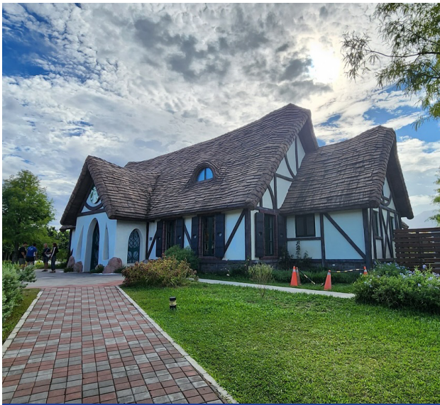
Starbucks Promiseland | 星巴克理想