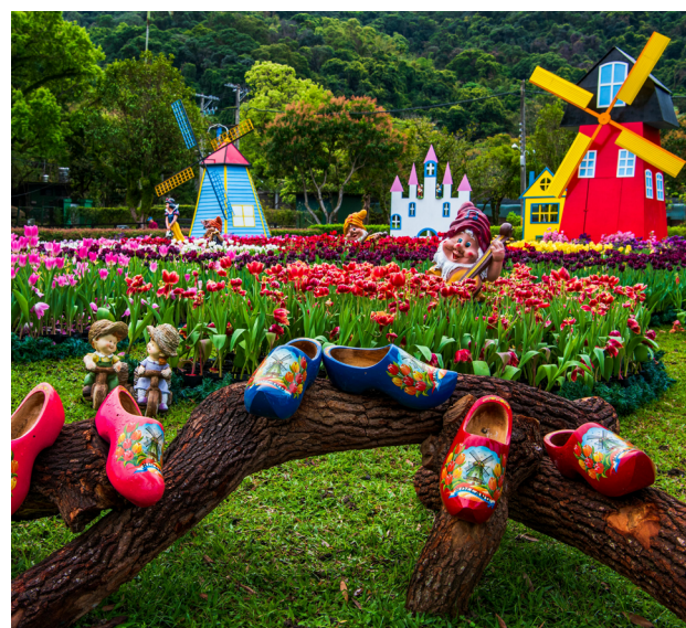
Chiang Kai-Shek Shilin Residence | 士林官邸