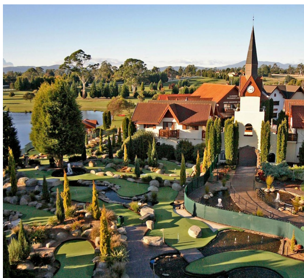
Grindelwald Swiss Village