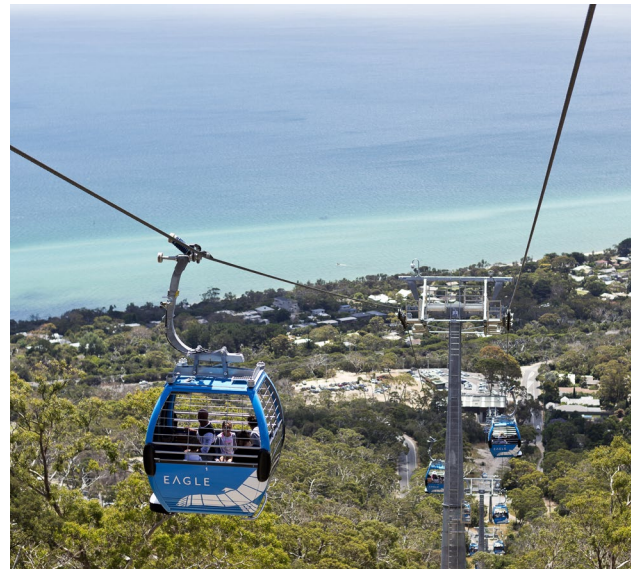
Gorge Scenic Chairlift