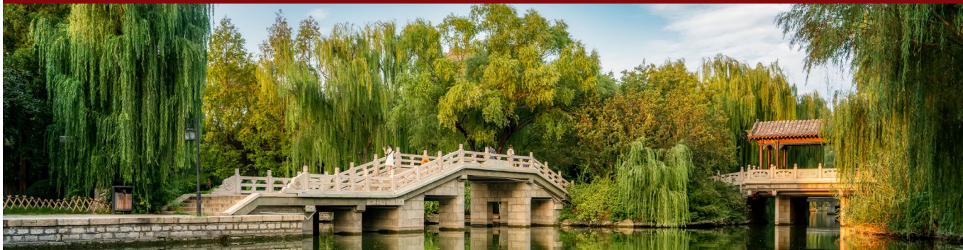
Daming Lake | 大明湖