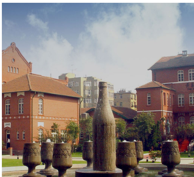
Qingdao Beer Pure Draft Tour | 青岛啤酒厂