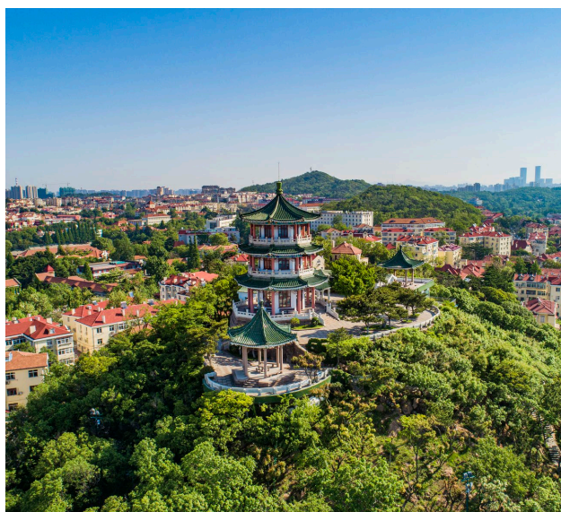
Little Fish Hill | 小鱼山