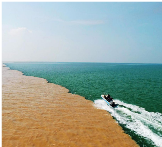
The Yellow River | 黄河