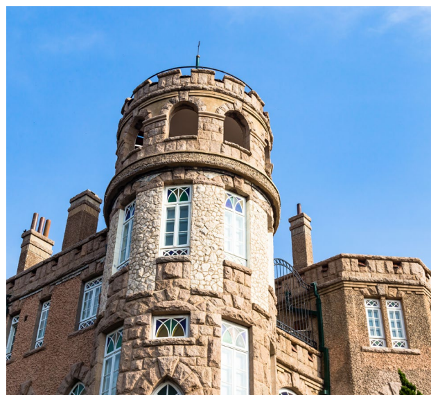
Badaguan | 八大关