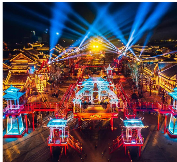
Langya Ancient City | 琅琊古城