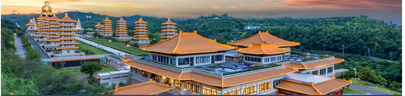
Fo Guang Shan Buddha Museum | 佛光山佛陀纪念馆