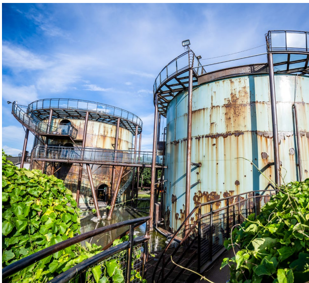
Ten Drum Cultural Village | 十鼓文化村