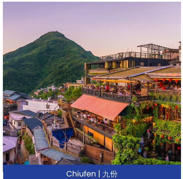
Chiufen | 九份