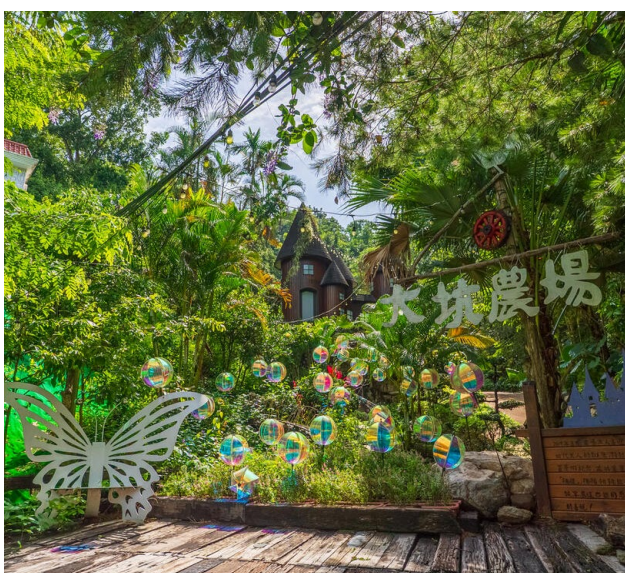
Dakeng Leisure Farm | 大坑休闲农场