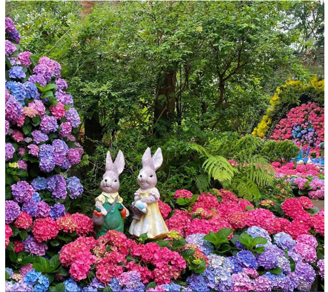
Flower Leisure Farm | 花露农场