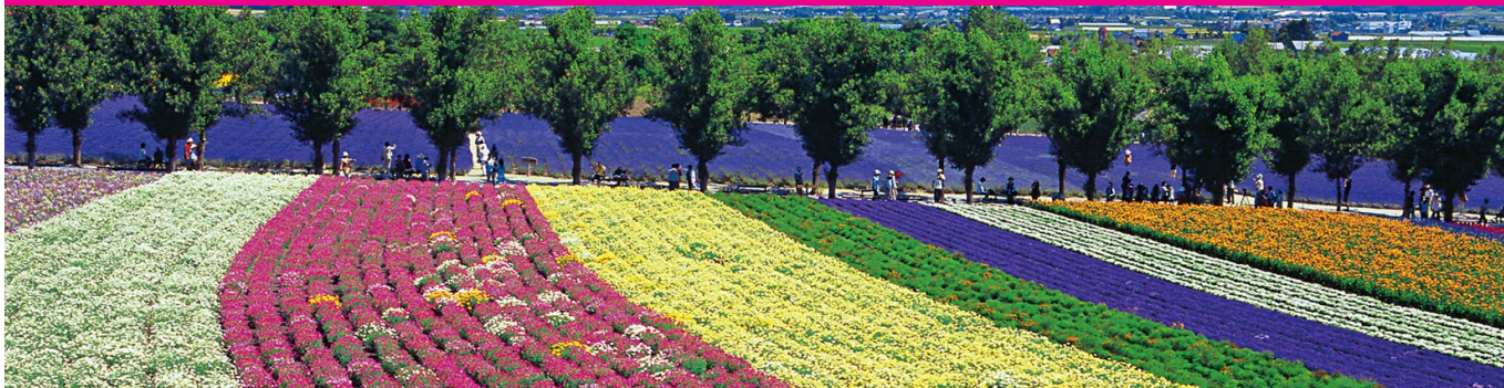
Farm Tomita | 富田农场