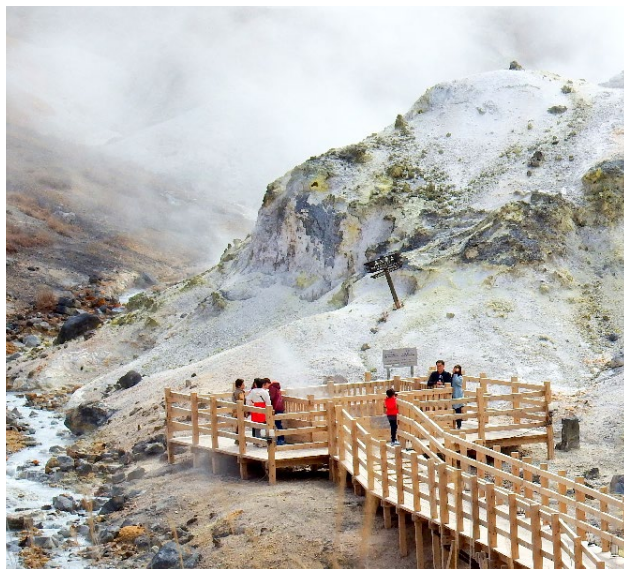
Jigokudani | 地獄谷