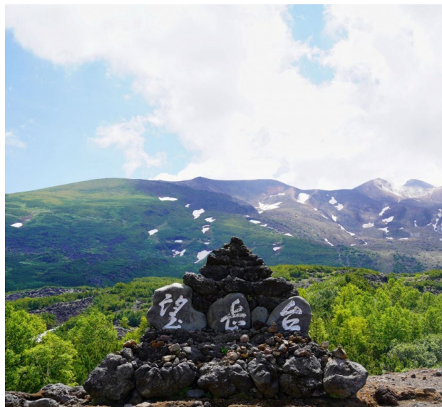
Tokachidake Observatory | 十勝岳望岳台