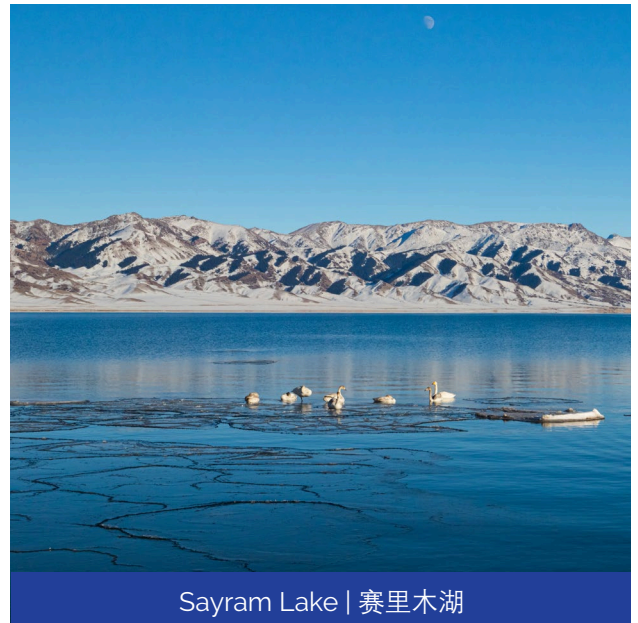
Sayram Lake | 赛里木湖