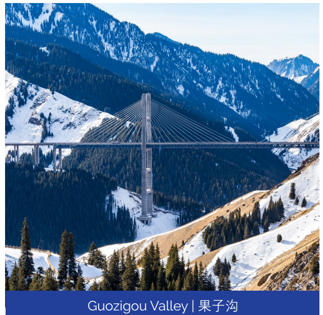
Guozigou Valley | 果子沟