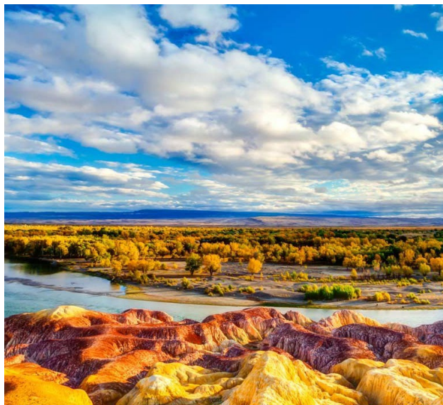
Buerjin | 布尔津