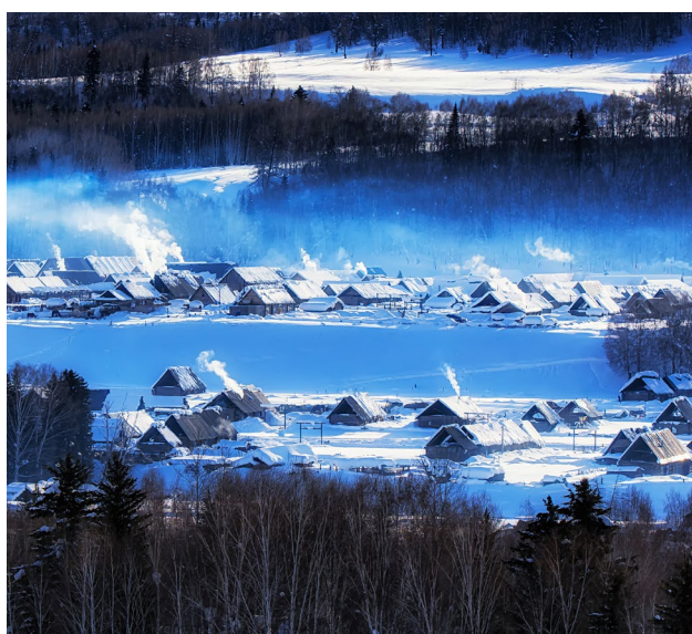
Kanas Scenic Area | 喀纳斯景区