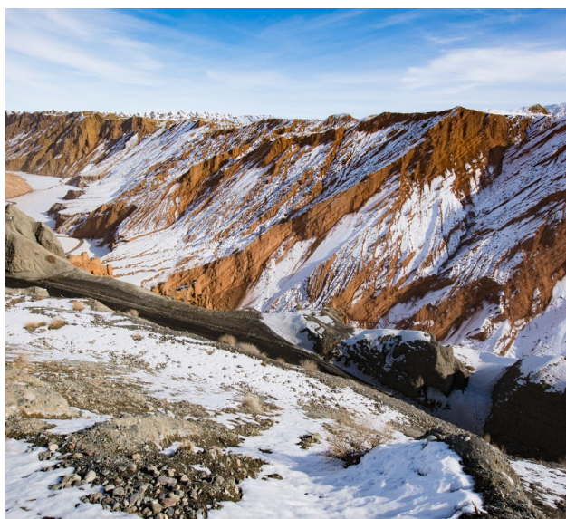
Kuitun | 奎屯