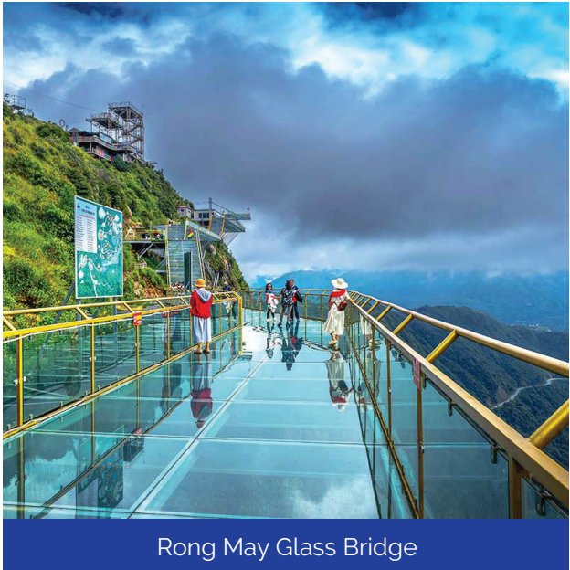
Rong May Glass Bridge