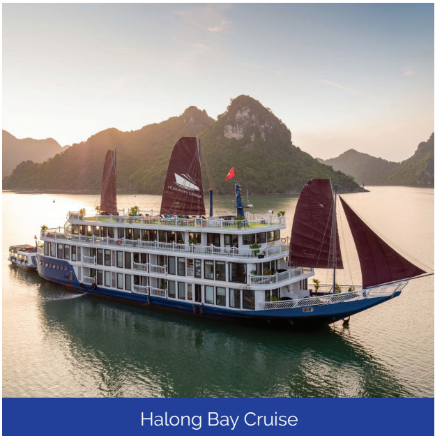
Halong Bay Cruise