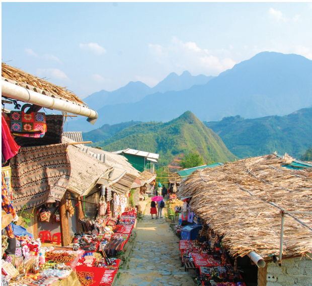
H'Mong Village (Cat Cat Village)