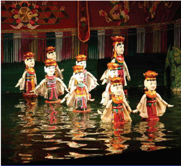
Water Puppet Show