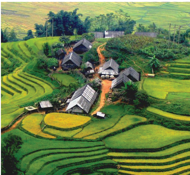
Tavan Observation Deck