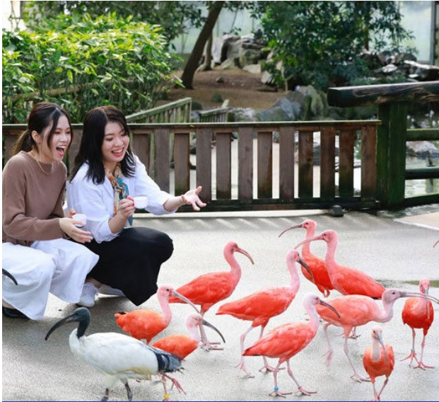
Matsue Vogel Park | 松江花鸟園