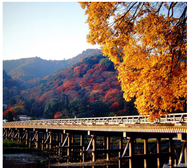
Togetsu-kyo Bridge | 渡月橋