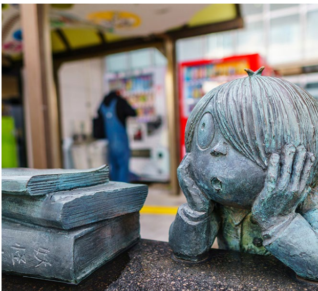
Mizuki Shigeru Road | 水木茂路