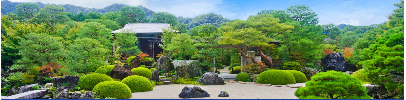
Adachi Museum Garden | 足立美术馆