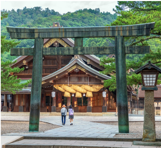
Izumo Taisha | 出云大社