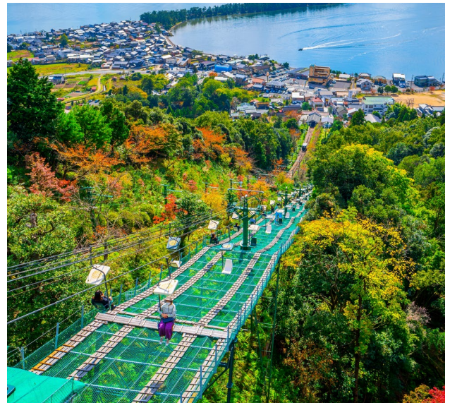
Amanohashitate | 天立橋