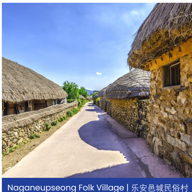
Naganeupseong Folk Village | 乐安邑城民俗村