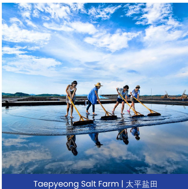
Taepyeong Salt Farm | 太平盐田