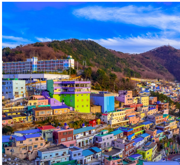
Gamcheon Culture Village | 甘川洞文化村