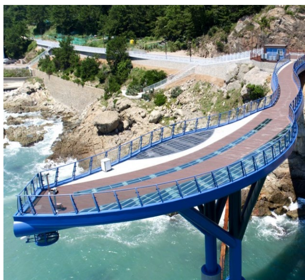
Cheongsapo Skywalk | 青沙浦天空步道