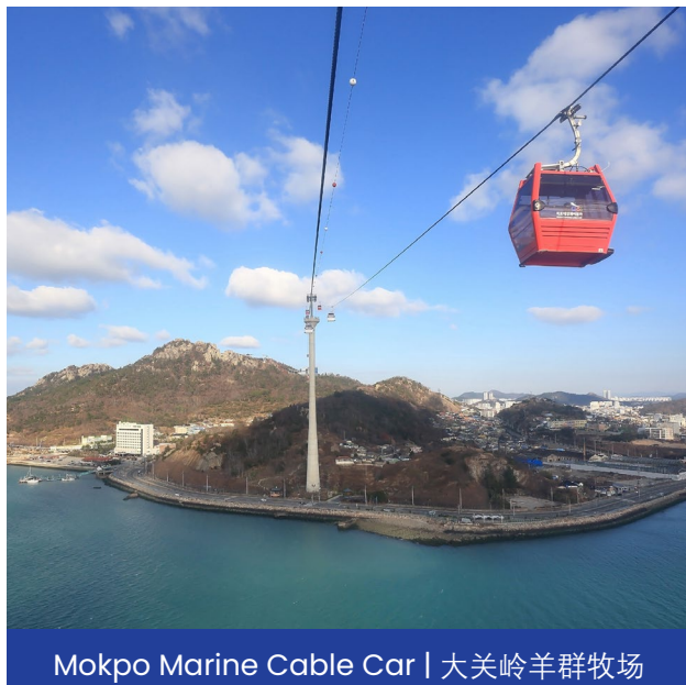
Mokpo Marine Cable Car | 大关岭羊群牧场