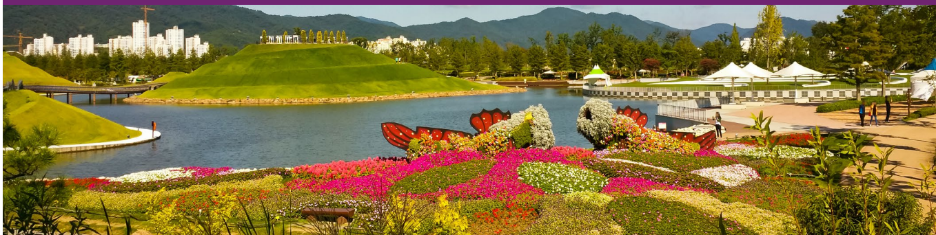
Suncheon Bay Garden | 顺天湾花园