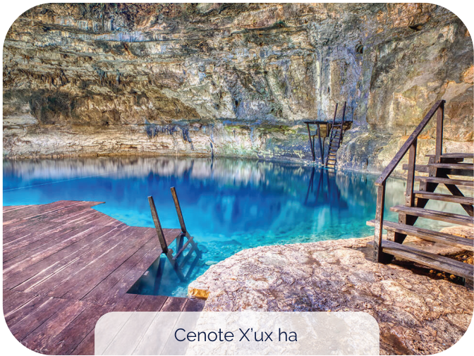
Cenote X'ux ha