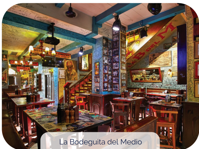
La Bodeguita del Medio