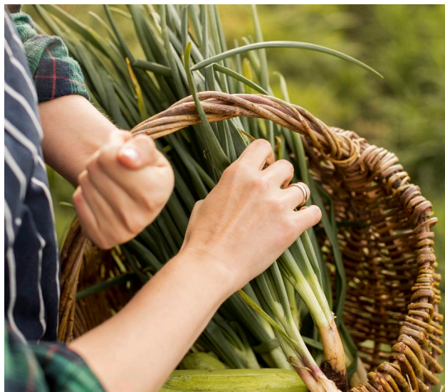
Yilan Baby Green Onion Experience Farm | 宜兰三星葱