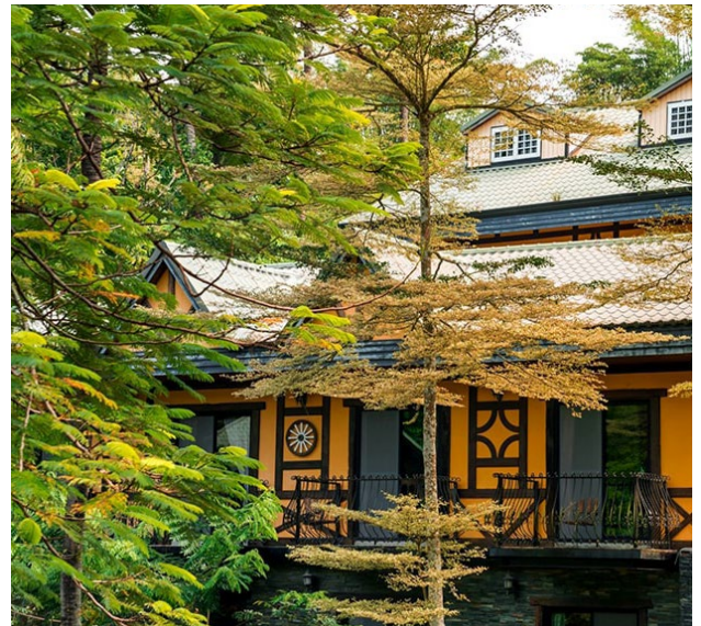
Dakeng Leisure Farm | 大坑休闲农场