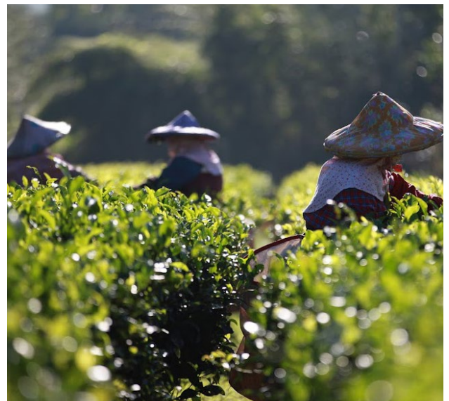
Hugosum | 和菓森林