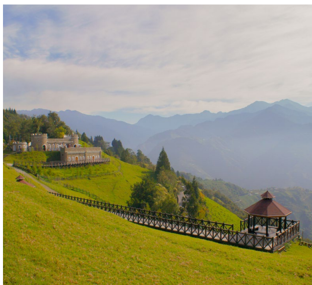
Green Green Grasslands | 青青草原