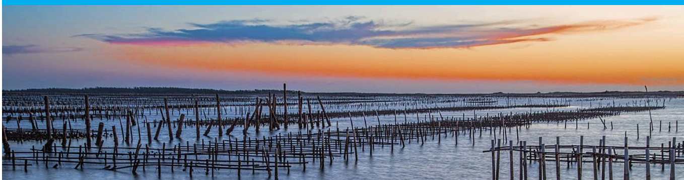
Chiku LongHai Eco Tour | 七股生态之旅