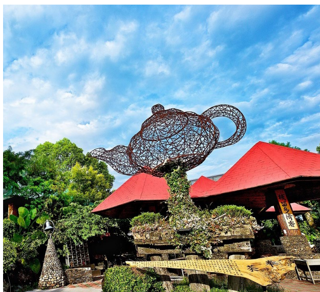
Shangri-La Leisure Farm | 香格里拉休闲农场