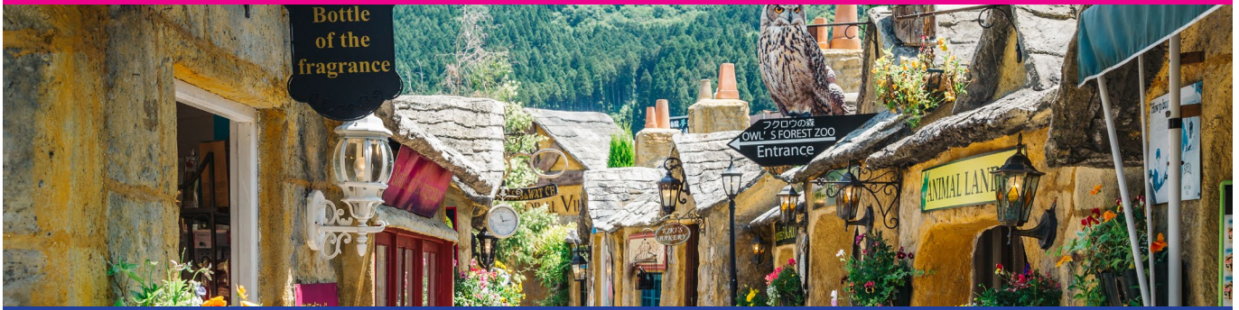
Yufuin Floral Village | 由布院花卉村