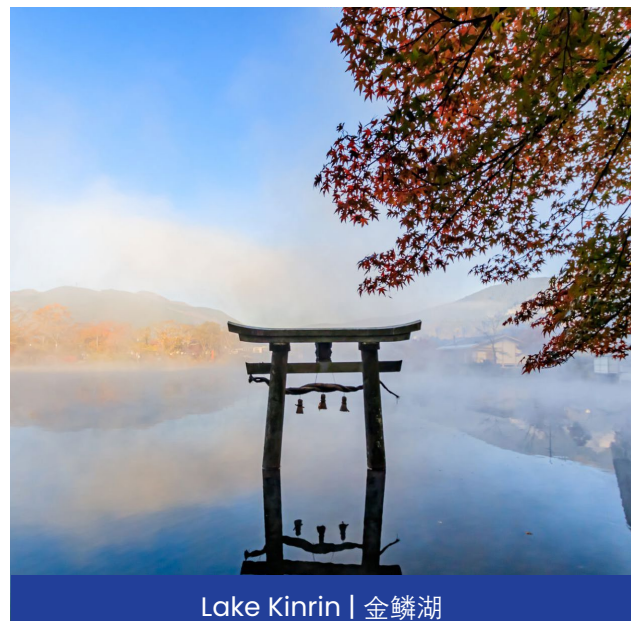
Lake Kinrin | 金鱗湖