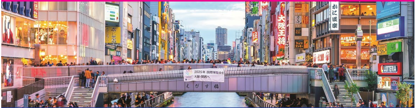
Dotonbori | 道顿堀