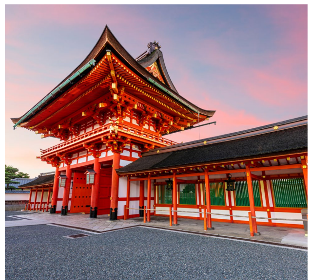
Fushimi Taisya Shrine | 伏見稻荷大社