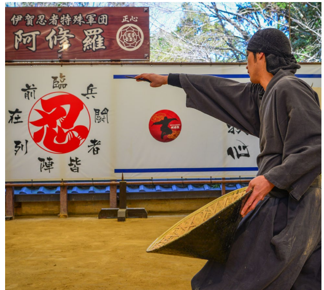
Ninja Museum | 伊賀忍者博物館