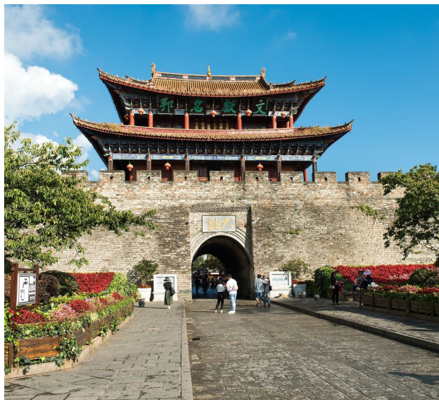
Dali Ancient Town | 大理古城