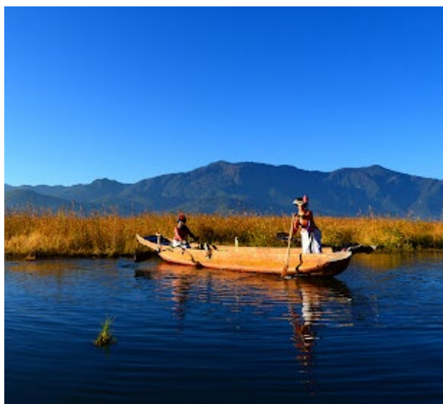
Lugu Lake | 泸沽湖