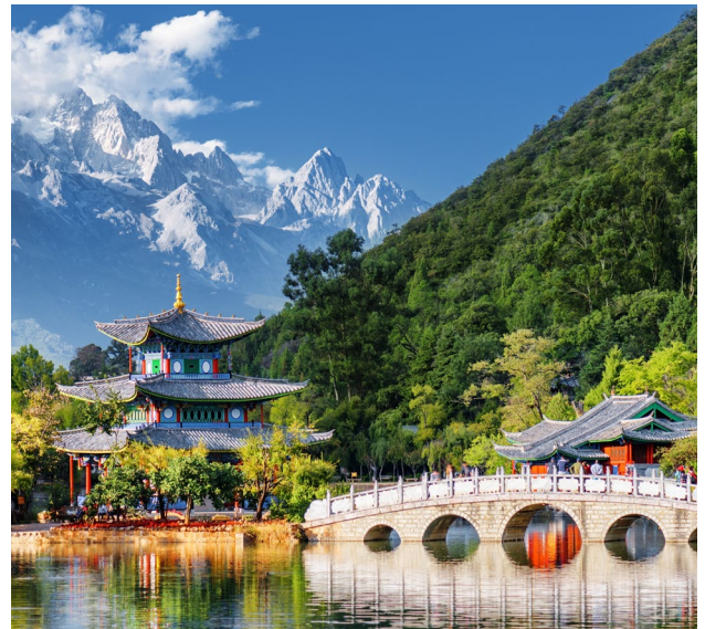
Black Dragon Pool | 黑龙潭