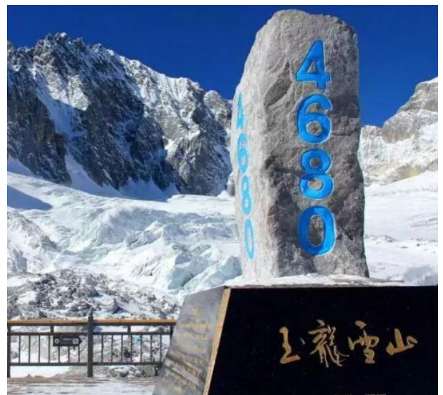
Jade Dragon Snow Mountain | 玉龙雪山