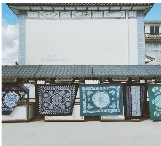
Xizhou Bai Ethnic Residences | 喜洲白族民居