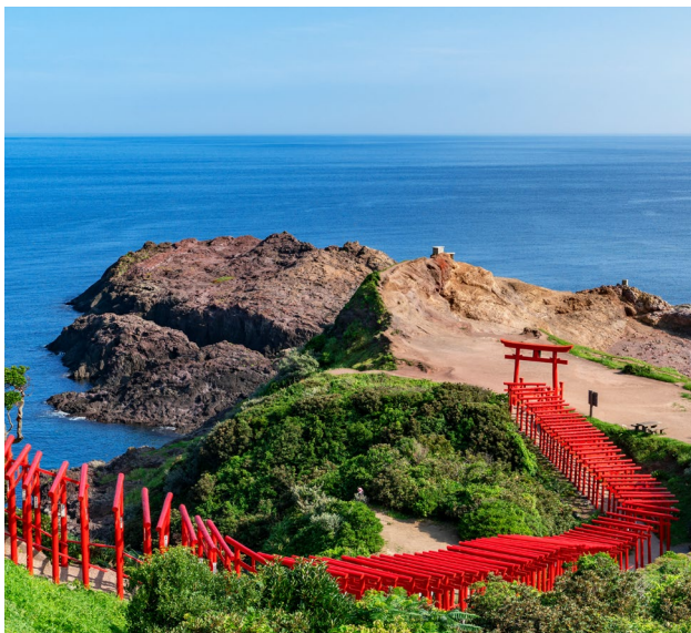
Motonosumi Shrine | 隅稻成神社