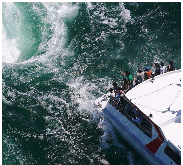
Naruto Bridge Cruise Ride | 大鸣桥游船之旅