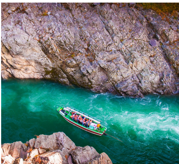
Oboke Iya | 大歩危峡