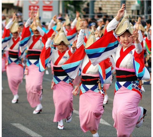
Awa Odori | 阿波舞蹈会馆