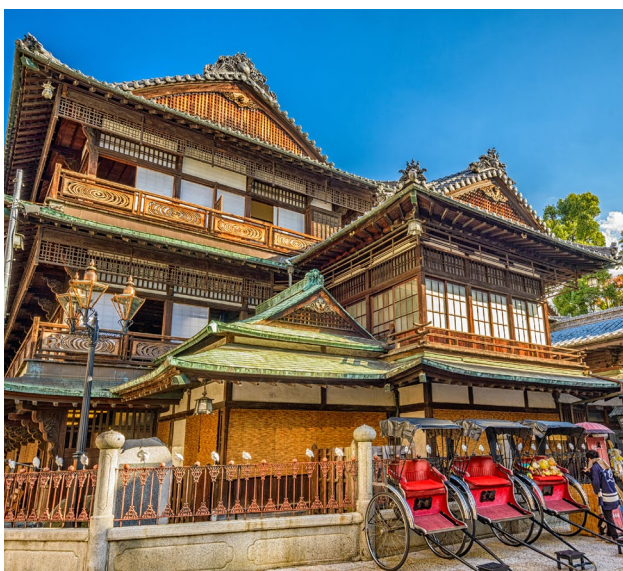
Dogo Onsen | 道后温泉