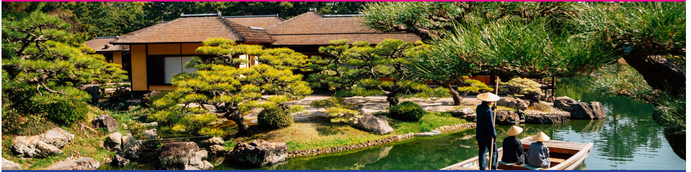
Ritsurin Garden | 栗林公园