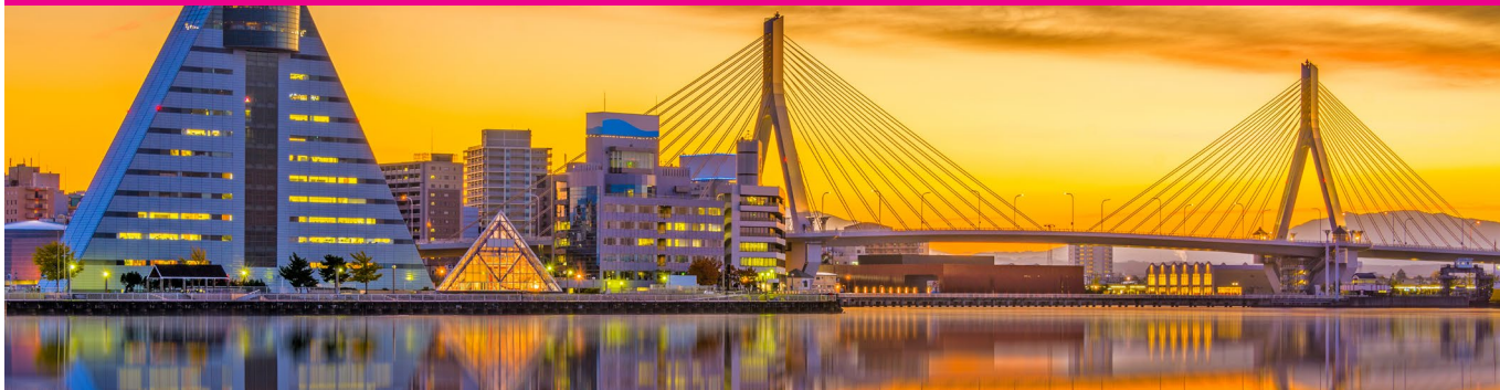
ASPAM | 青森县观光物产馆