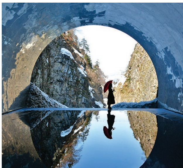
Kiyotsu Gorge | 清津峡