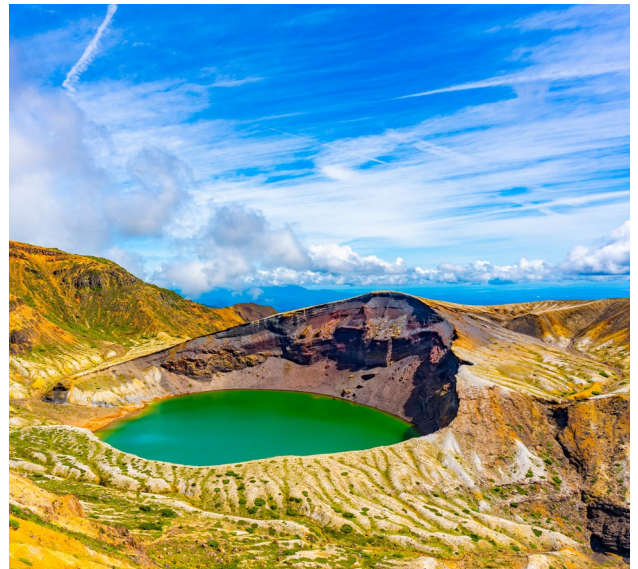
Mt. Zao | 藏王山