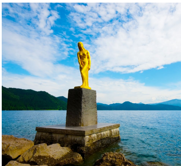
Lake Tazawa | 田澤湖