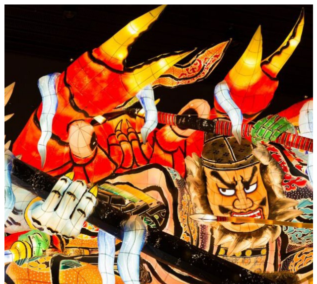
Nebuta Museum | 睡魔之家