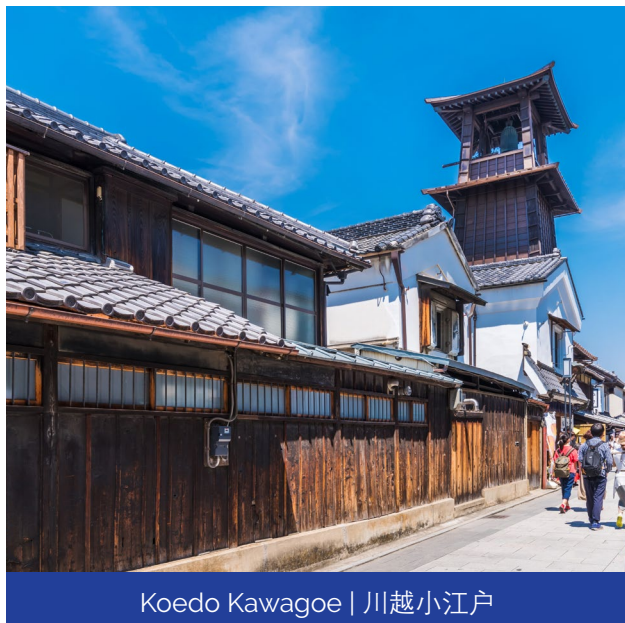
Koedo Kawagoe | 川越小江戸