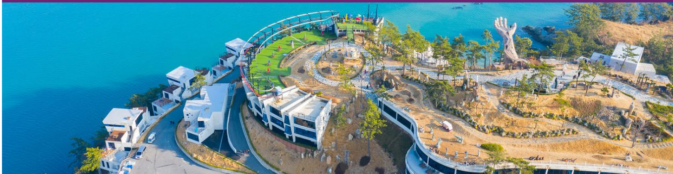
Yeosu Art Land | 丽水艺术公园