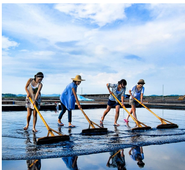
Salt Farm | 盐田