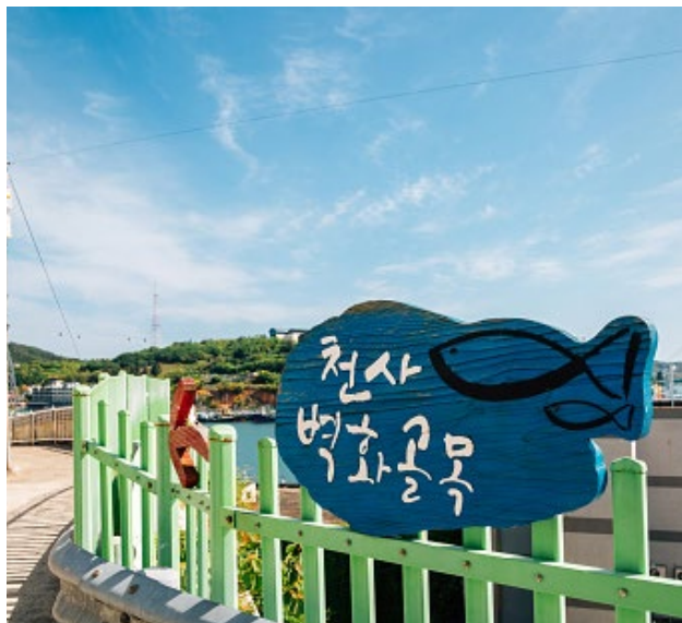
Goso-dong Mural Village | 姑苏洞壁画村