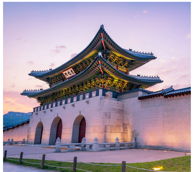
Gyeongbokgung Palace | 景福宫