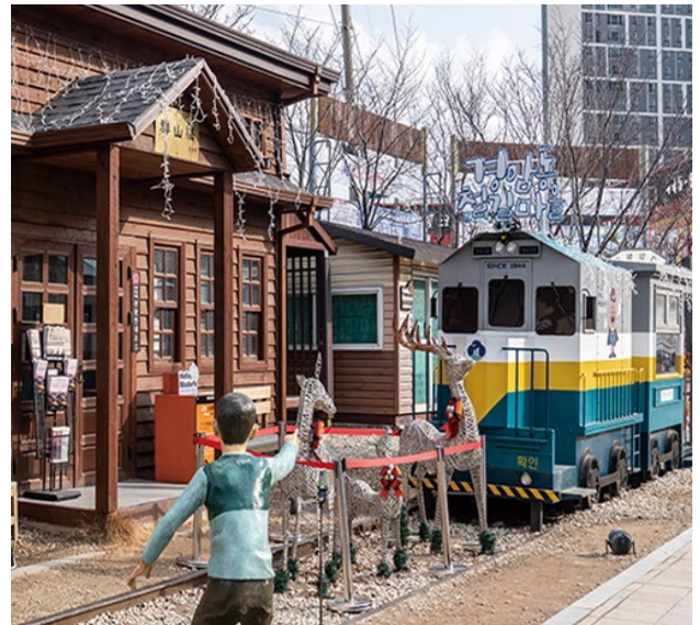
Gyeongamdong Railroad | 京岩铁路村