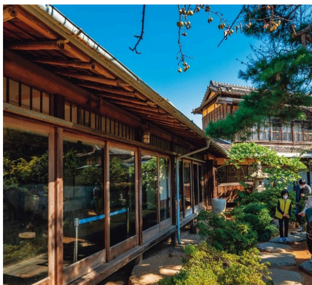
Hirotzu House | 新兴洞日本式家屋