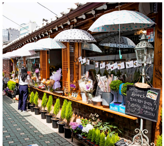
Ikseon-dong Hanok Street | 益善洞韩屋街