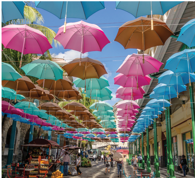
Port Louis Central Market