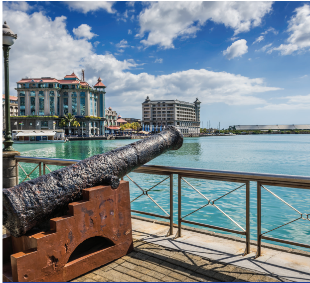
Le Caudan Waterfront