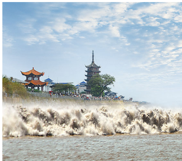
Yangtze Tide-Watching City | 盐官潮乐之城