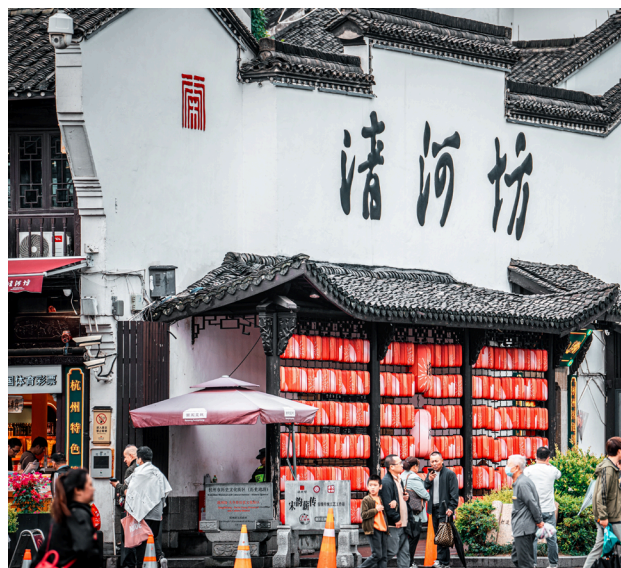
Hefang Street | 河坊街