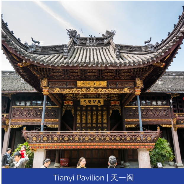
Tianyi Pavilion | 天一阁