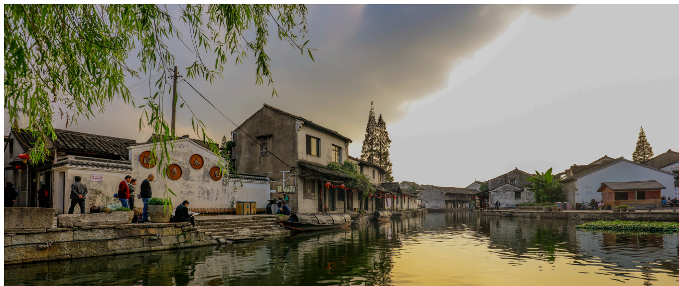
Shaoxing Rice Wine Town | 绍兴黄酒小镇