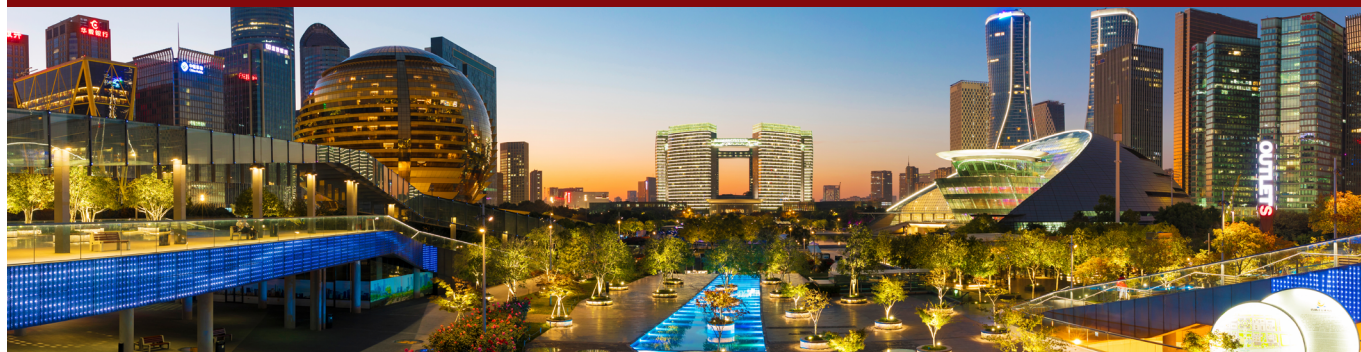
City Balcony | 城市阳台