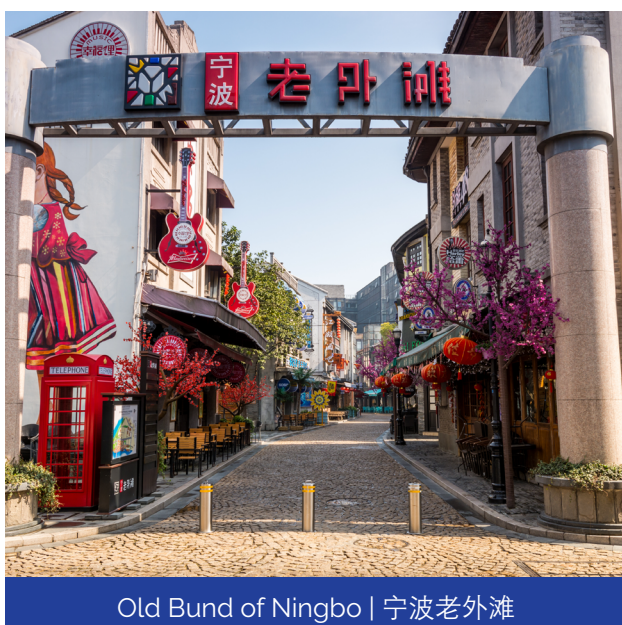
Old Bund of Ningbo | 宁波老外滩