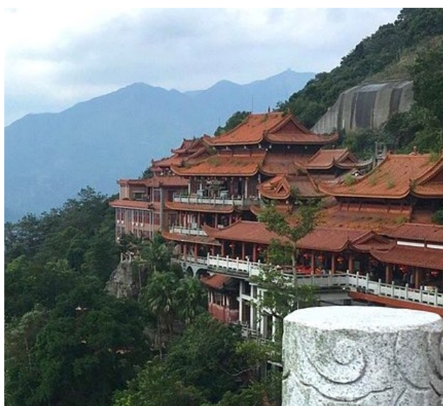
Stone Bamboo Mountain | 石竹山