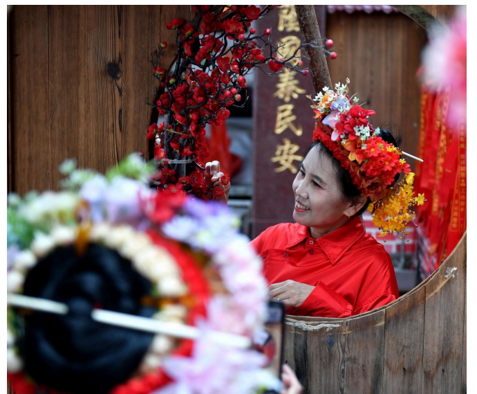
Xunpu Hairpin Flower | 蟳埔簪花