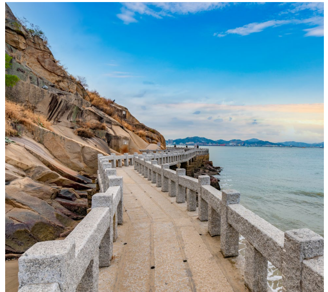
Gulangyu Island | 鼓浪屿