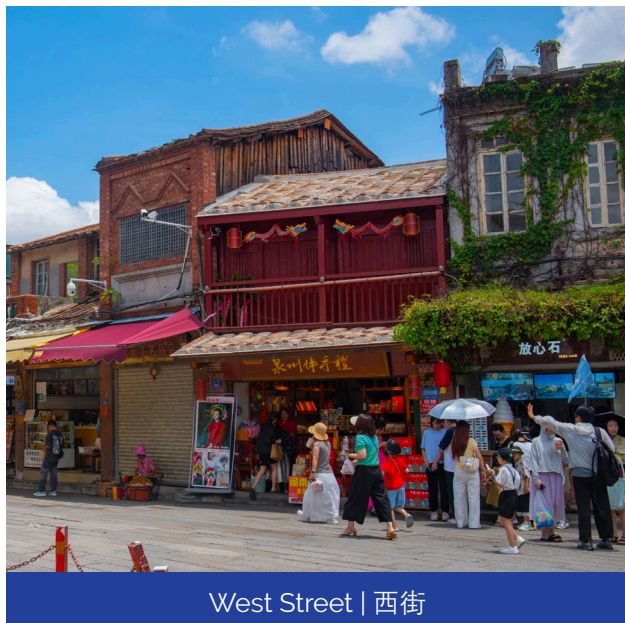
West Street | 西街