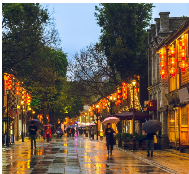
Sanfang Qixiang | 三坊七巷步行街