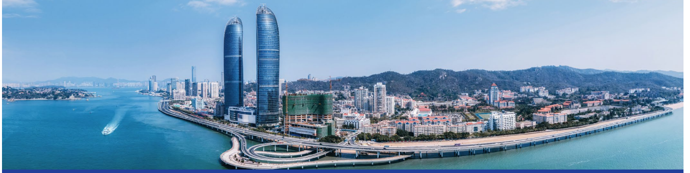
Yanwu Bridge Viewing Platform & Starlight Avenue | 演武大桥观景平台+星光大道