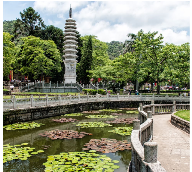
Nanputuo Temple | 南普陀寺