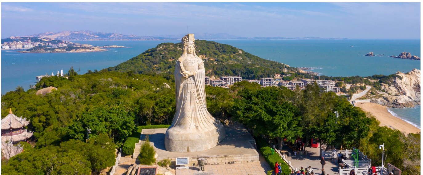
Meizhou Island | 湄洲岛