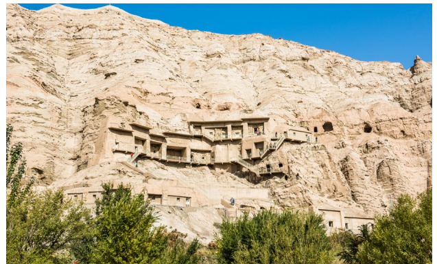
Kizil Thousand-Buddha Caves | 克孜尔千佛洞