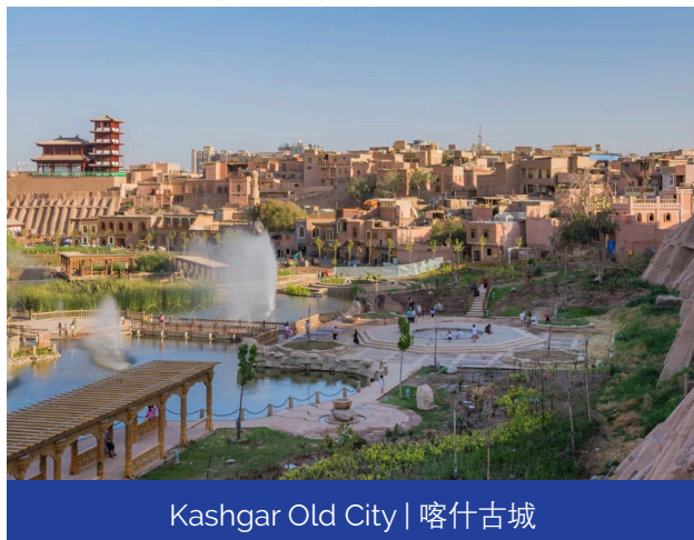
Kashgar Old City | 喀什古城