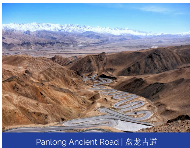
Panlong Ancient Road | 盘龙古道