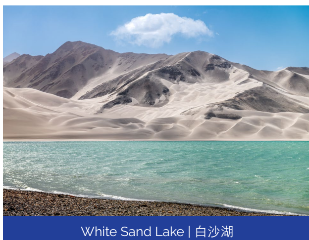
White Sand Lake | 白沙湖