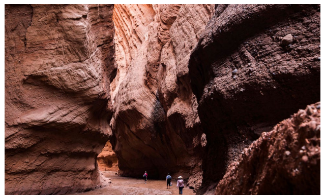
Kuqa Canyon | 库车峡谷