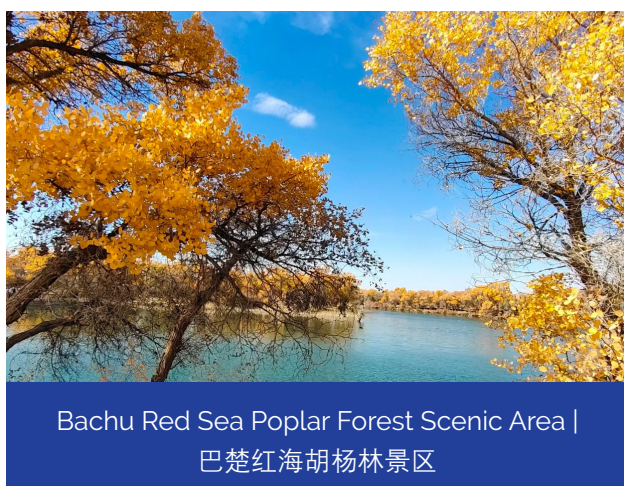
Bachu Red Sea Poplar Forest Scenic Area | 巴楚红海胡杨林景区