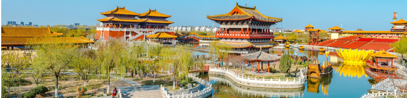
Qingming Riverside Landscape Park | 清明上河园