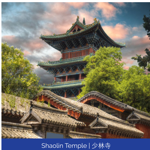
Shaolin Temple | 少林寺