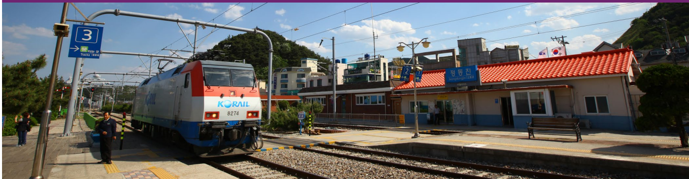
Jeongdongjin Train Station | 东津火车站