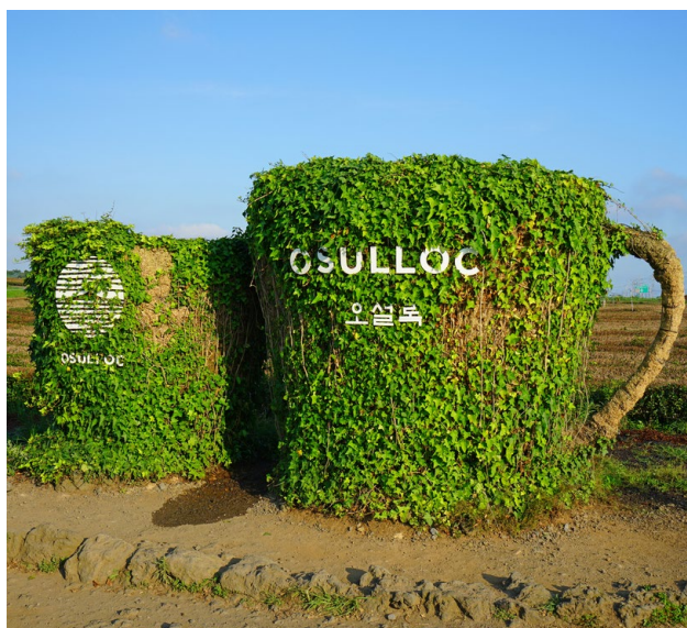
O'Sulloc Green Tea Museum | 绿茶博物馆