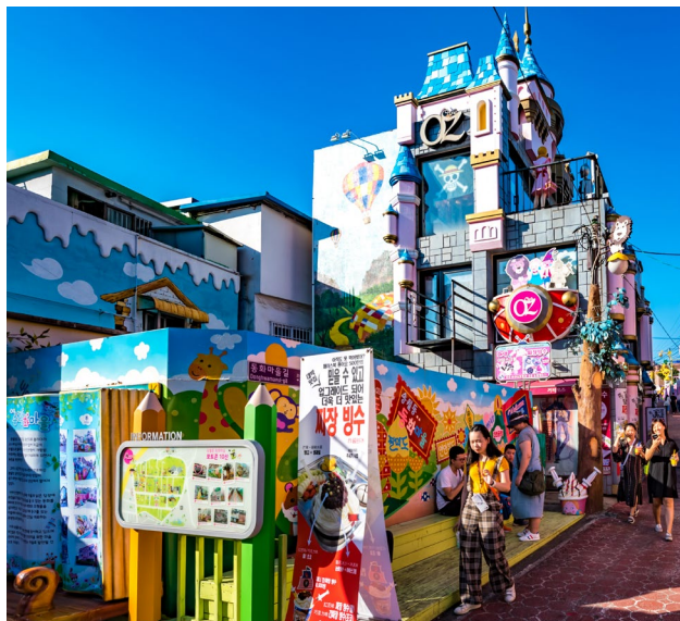
Songwol-dong Fairy Village | 松月洞童话村