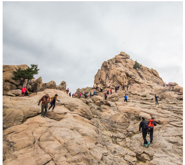
Mount Seorak National Park | 雪狱山国家公园