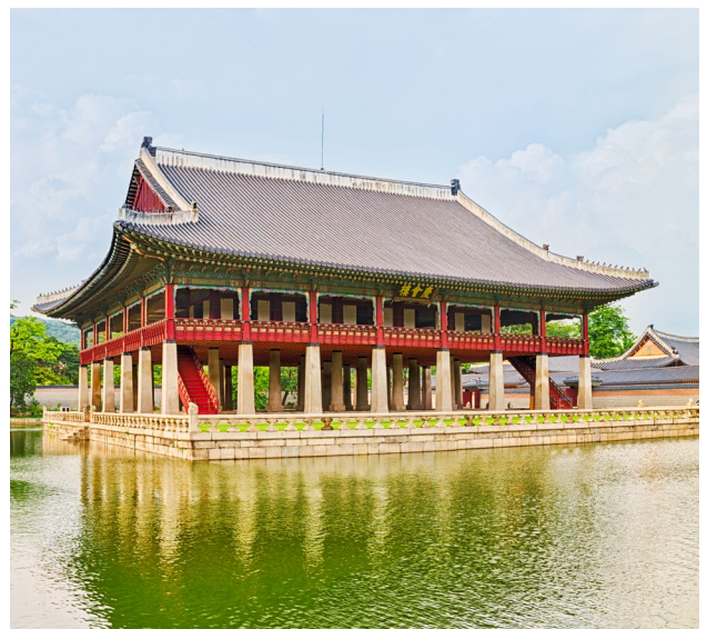
Gyeongbokgung Palace | 景福宫