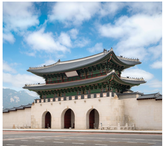
Gyeongbokgung Palace | 景福宫