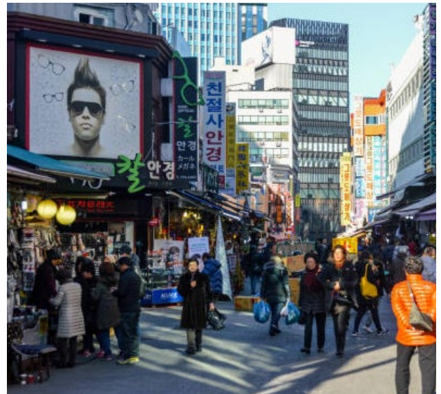
Dongdaemun Market | 东大门市场