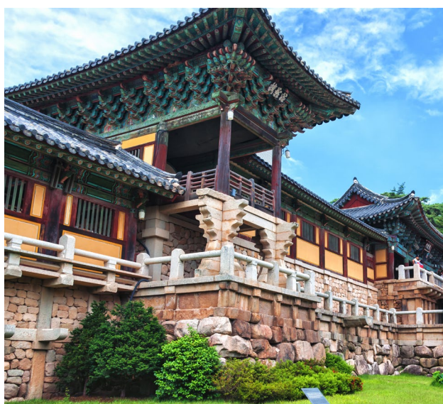
Bulguksa Temple | 佛国寺