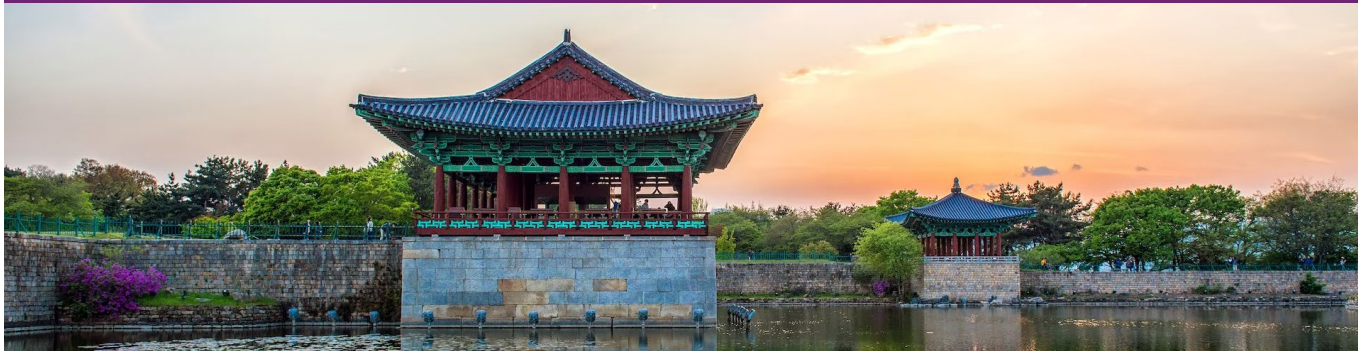
Donggung Palace | 东宫