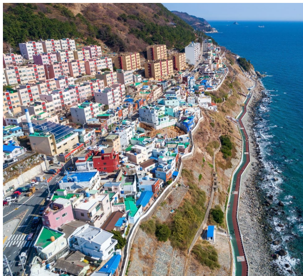
Huinnyeol Culture Village | 白浅滩文化村