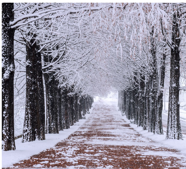
Nami Island | 南怡岛