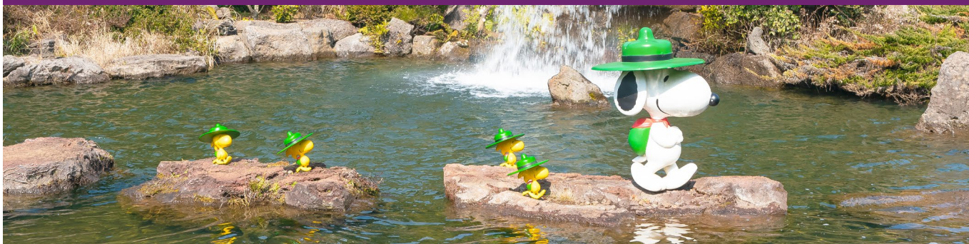
Snoopy Garden | 史努比主题乐园