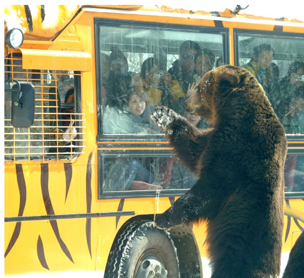
Everland | 爱宝乐园