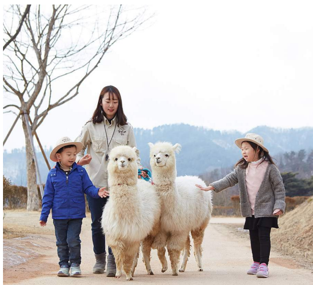
Alpaca World Park | 羊驼世界公园