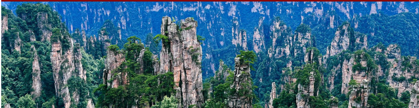
Tianzi Mountain Core Scenic Area | 天子山核心景区