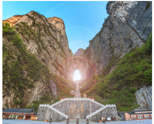
Tianmen Mountain National Forest Park | 天门山国家森林公园