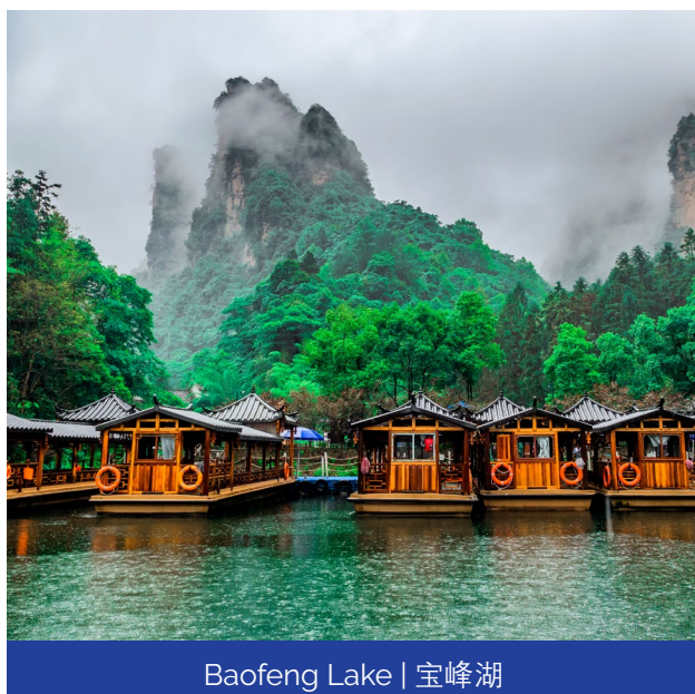
Baofeng Lake | 宝峰湖