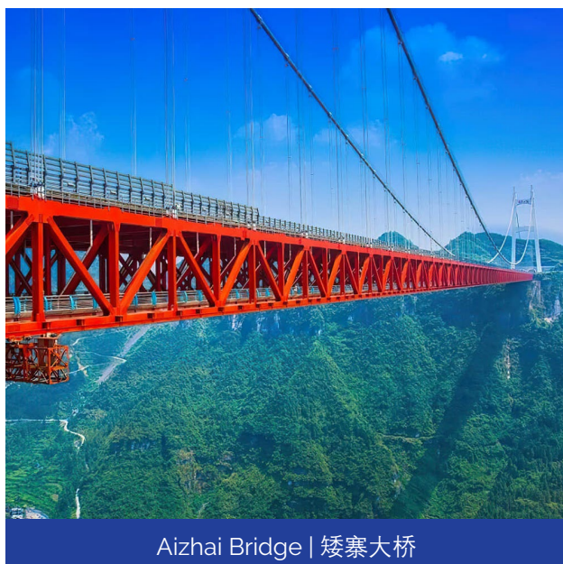
Aizhai Bridge | 矮寨大桥