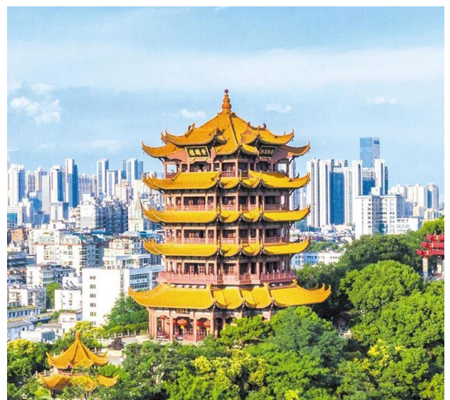
Yellow Crane Tower | 黄鹤楼