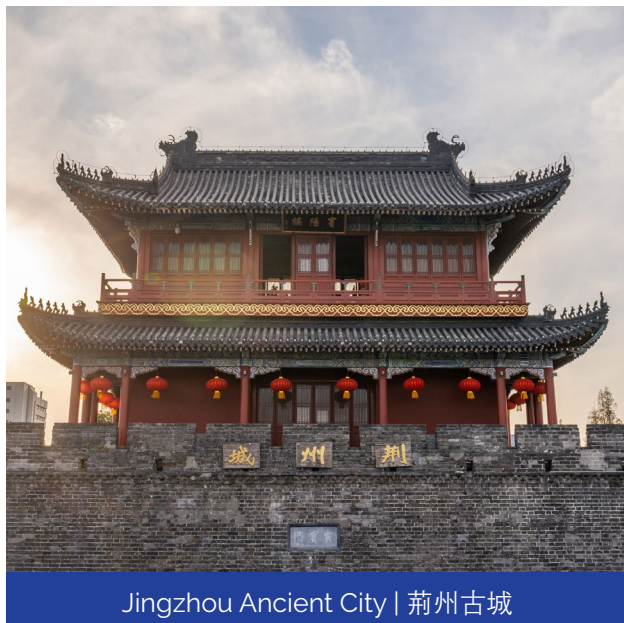
Jingzhou Ancient City | 荊州古城