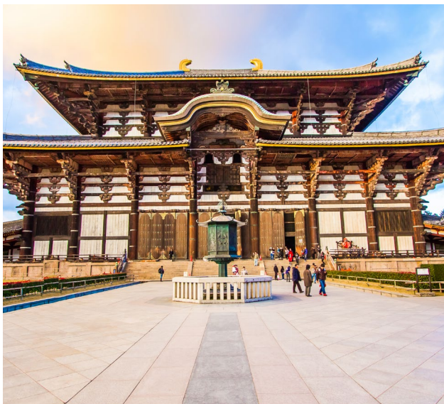
Todaiji Temple | 东大寺