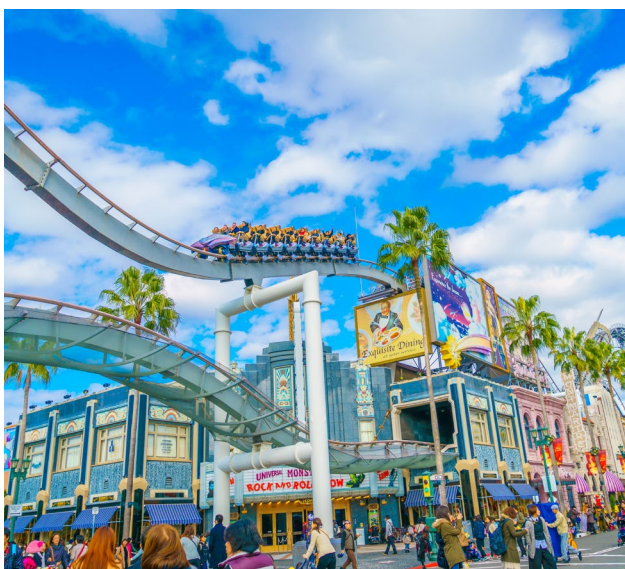
Universal Studios | 环球影城