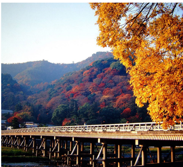
Togetsu-kyo Bridge | 渡月桥