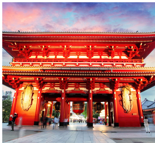
Asakusa Kannon Temple | 浅草観音寺