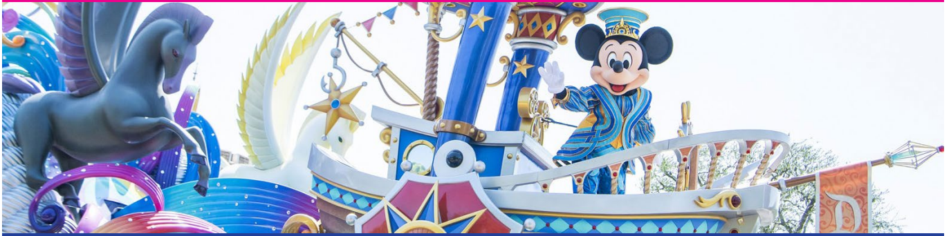
Tokyo Disneyland | 东京迪士尼乐园