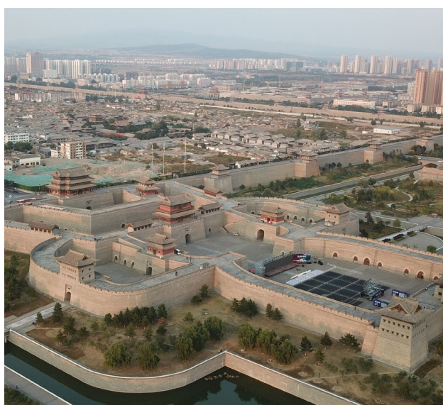
Ancient City Wall of Datong | 大同古城墙

Accommodation: Hohhot Ruiya Qingcheng Hotel or similar class