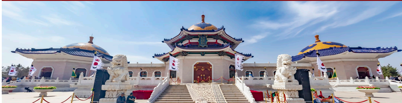
Genghis Khan Mausoleum | 成吉思汗陵