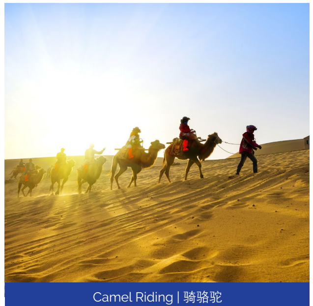
Camel Riding | 骑骆驼