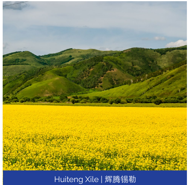
Huiteng Xile | 辉腾锡勒