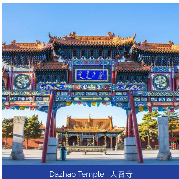
Dazhao Temple | 大召寺