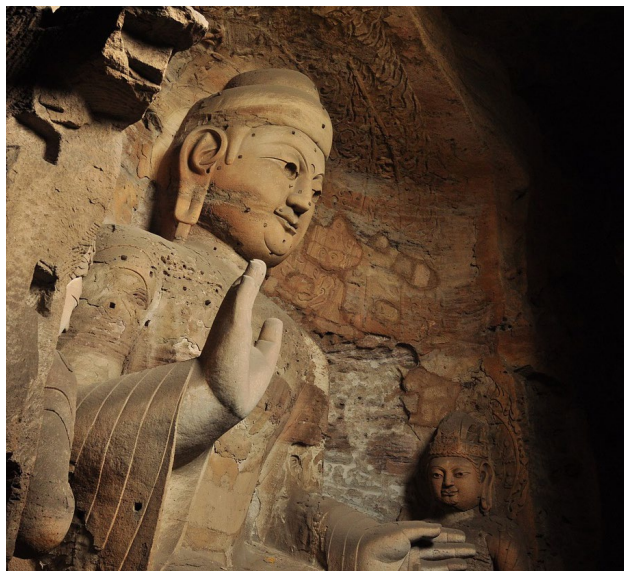
Yungang Grottoes | 云冈石窟