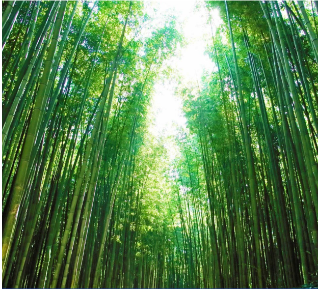
Taehwagang National Garden | 太和江国家庭院