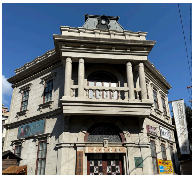
Hapcheon Film Park | 陝川影像主题公园