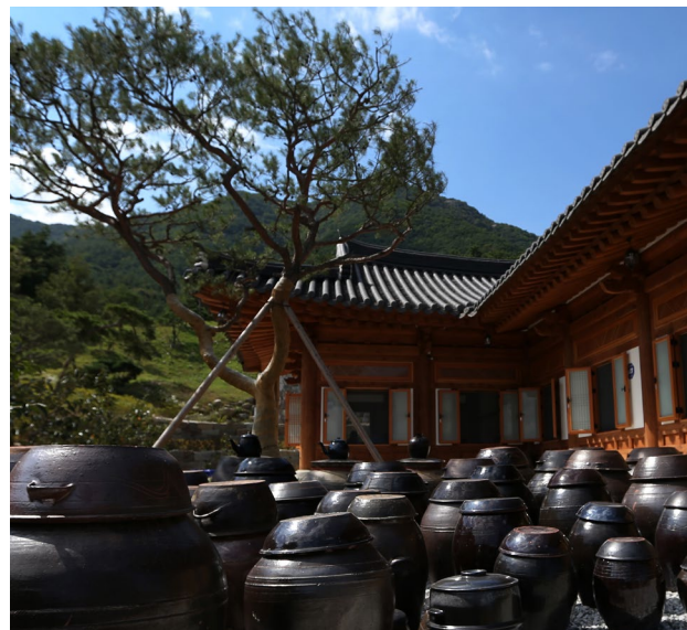
Donguibogam Village | 东医宝鉴村