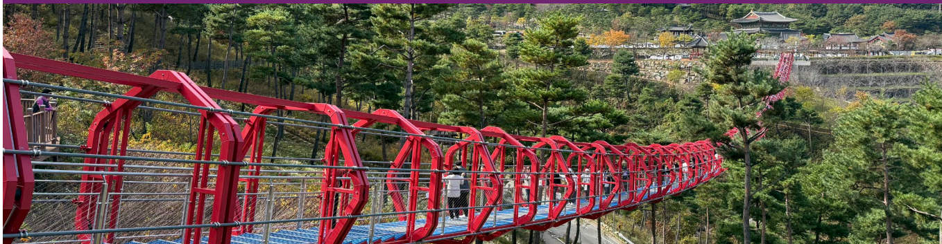
Mureunggyo Bridge | 武陵桥