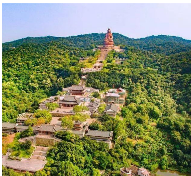
Xiqiao Mountain Scenic Area | 西樵山风景名胜區