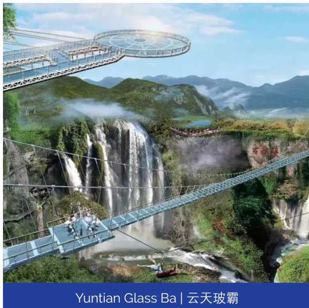
Yuntian Glass Ba | 云天玻璃