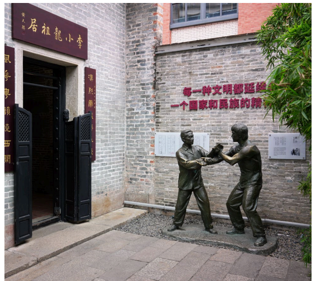
Bruce Lee Ancestral Home | 李小龙故居