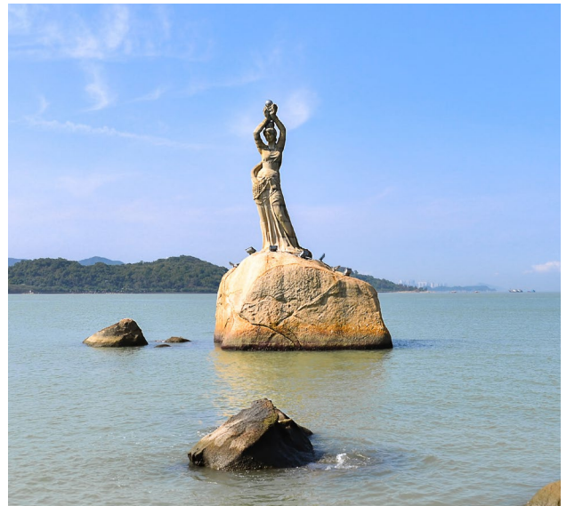
Zhuhai Fisher Girl Statue | 珠海渔女雕像