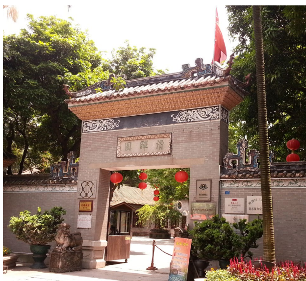
Qinghui Garden | 清晖园