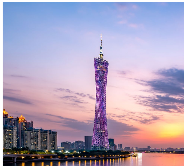
Canton Tower | 广州塔