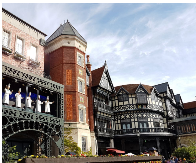
Ishiya White Chocolate Factory | 白之恋人巧克力工厂