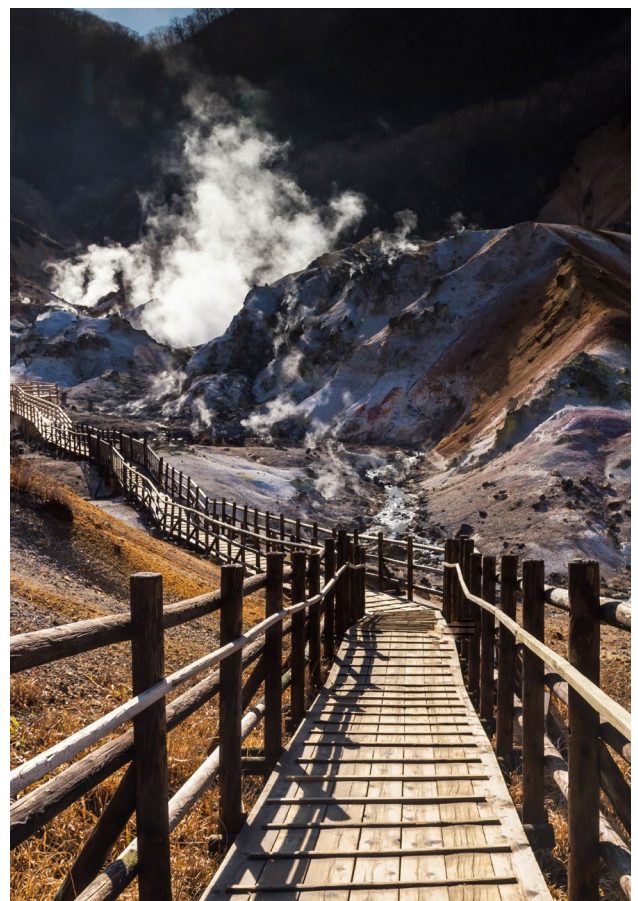
Jigokudani | 地獄谷