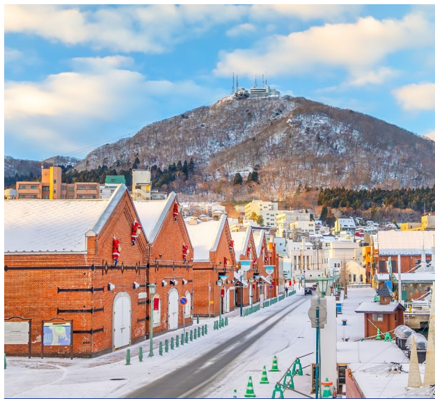
Kanemori Red Brick Warehouse | 金森红砖仓库