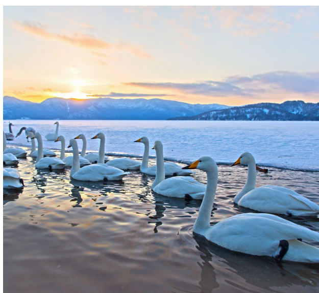
Kussharo Lake | 屈斜路湖