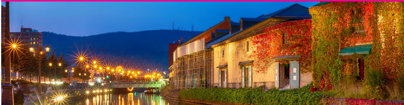
Otaru Canal | 小樽运河