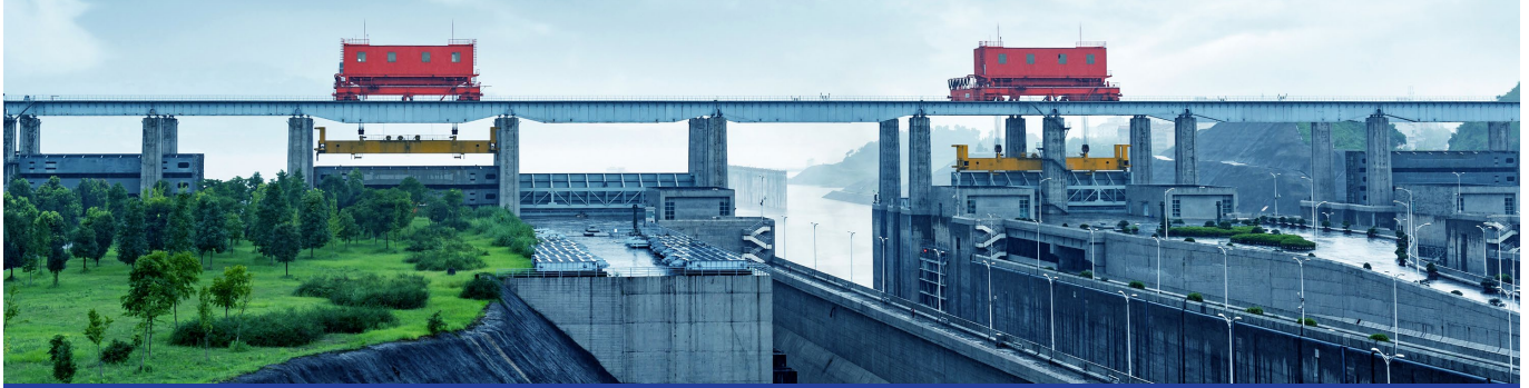
Three Gorges Dam | 三峡大坝