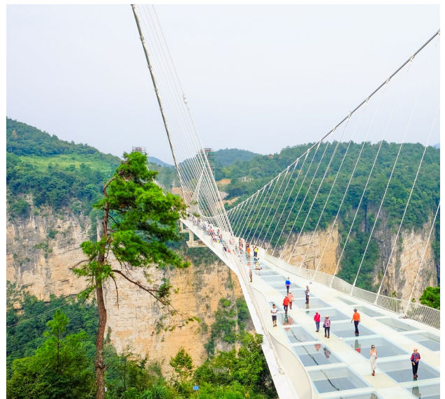
Grand Canyon Scenic Area | 大峡谷景区