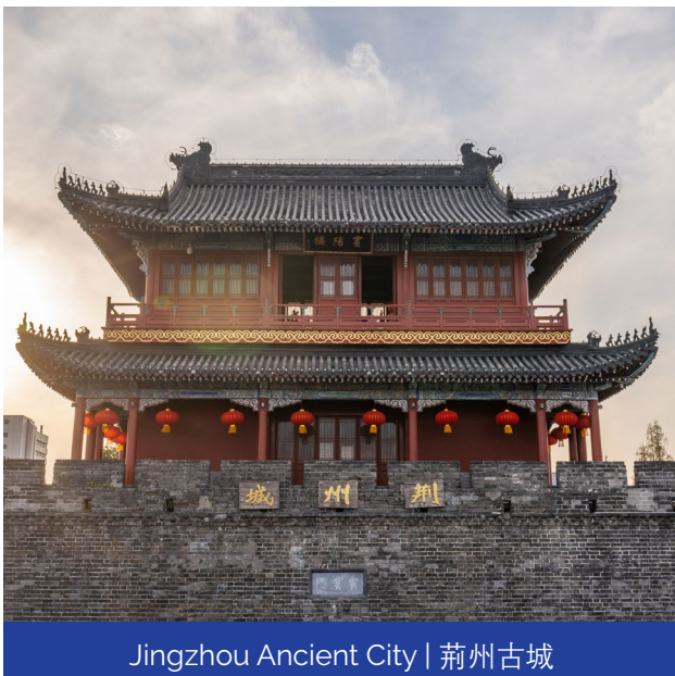
Jingzhou Ancient City | 荊州古城