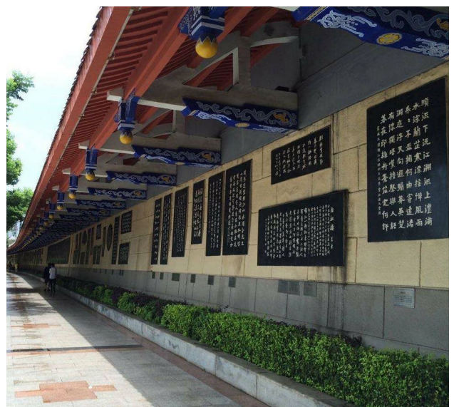
Changde Poetry Wall | 常德诗墙