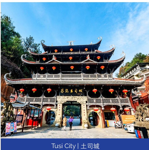
Tusi City | 土司城