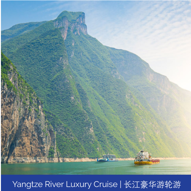
Yangtze River Luxury Cruise | 长江豪华游轮游