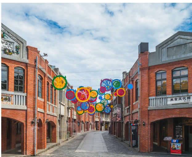
National Center for Traditional Arts | 传统艺术中心