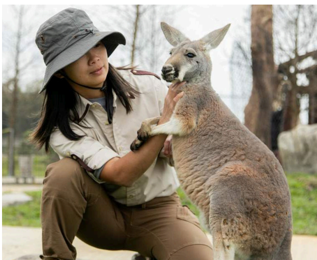
Lanyang Animal and Plant Kingdom | 兰阳动植物王国