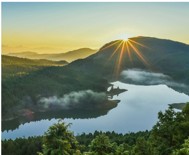
Taipingshan National Forest | 太平山国家森林游乐区