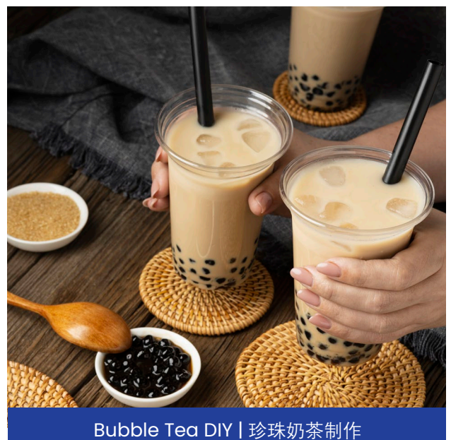
Bubble Tea DIY | 珍珠奶茶制作