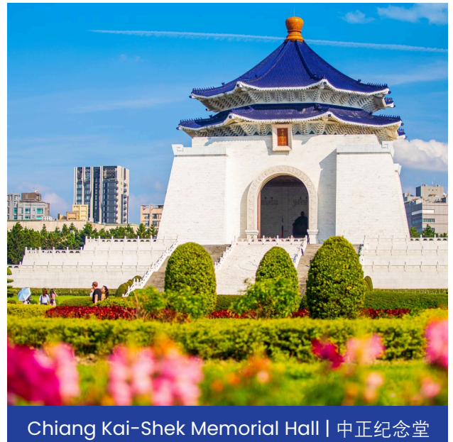
Chiang Kai-Shek Memorial Hall | 中正紀念堂