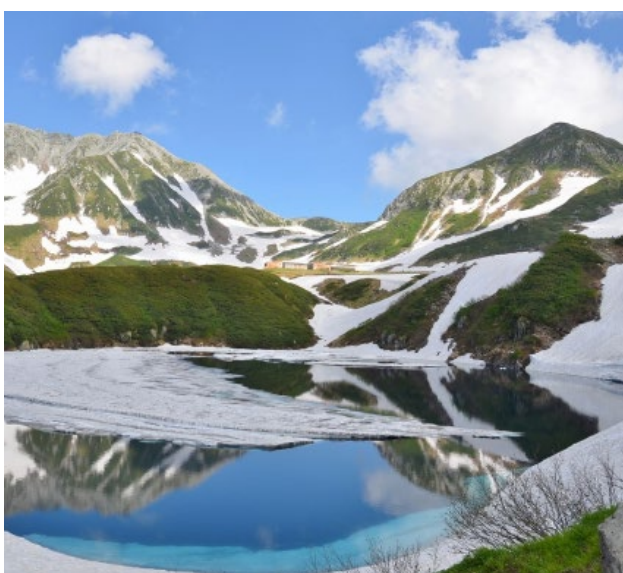
Tateyama National Park | 立山国家公园