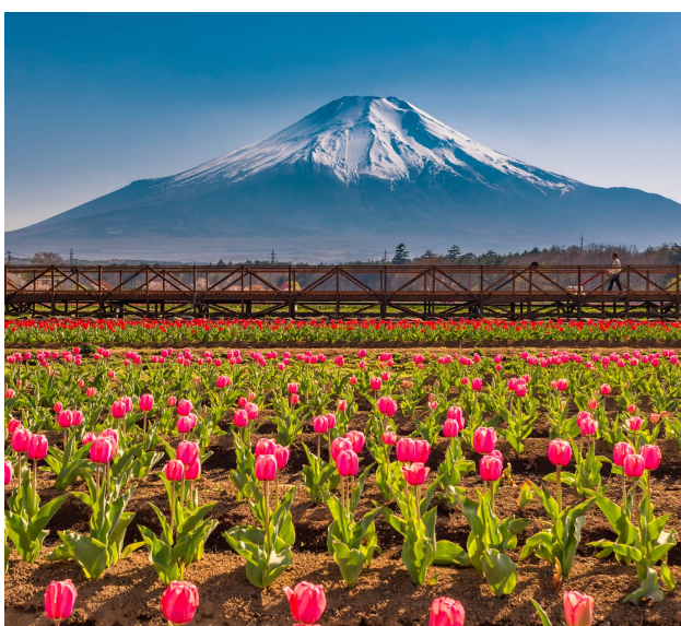
Yamanakako Hanano Miyako Park | 花之都公园