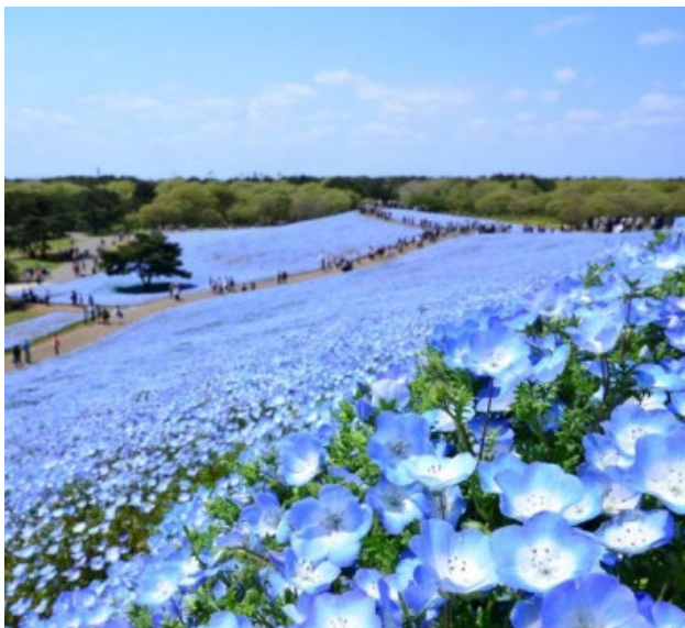
Hitachi Seaside Park | 日立海滨公园