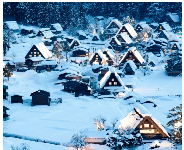
Shirakawa-go Ogimachi Gassho Village | 白川郷荻町合掌村