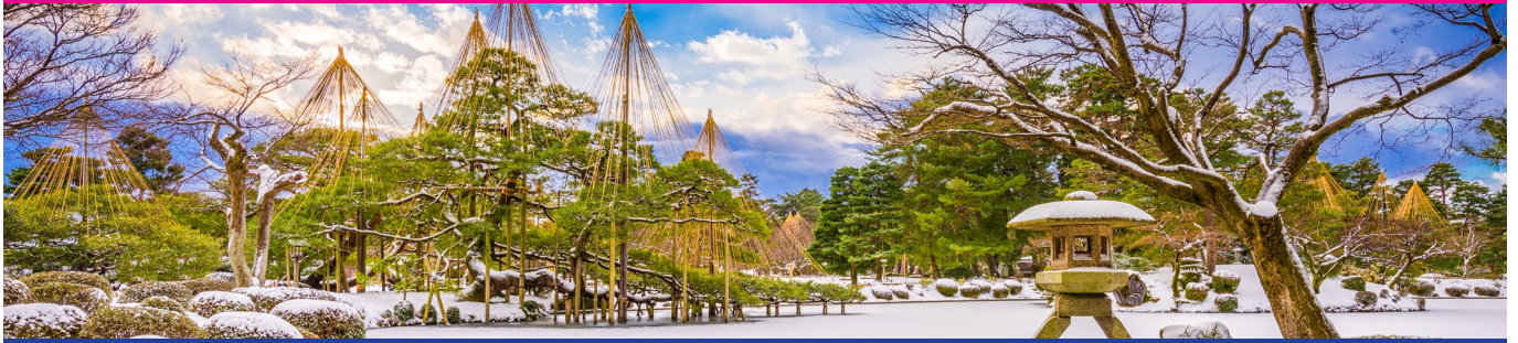
Kenroku-en Garden | 兼六园