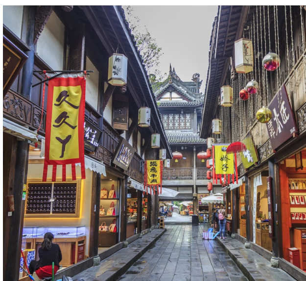
Jinli Ancient Street | 锦里古街