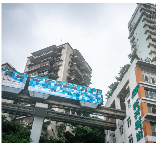
Liziba Monorail Station | 李子坝轻轨站