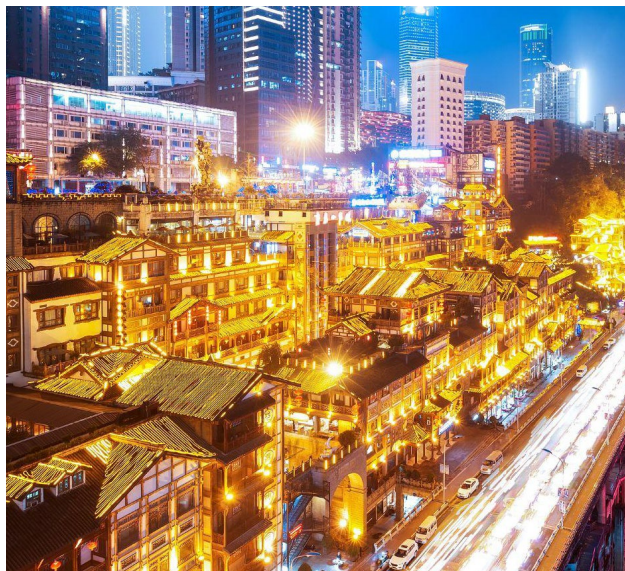
Hong Ya Cave | 洪崖洞