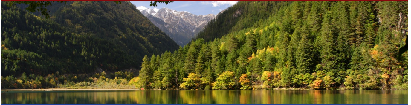
Jiuzhaigou National Park | 九寨沟国家公园