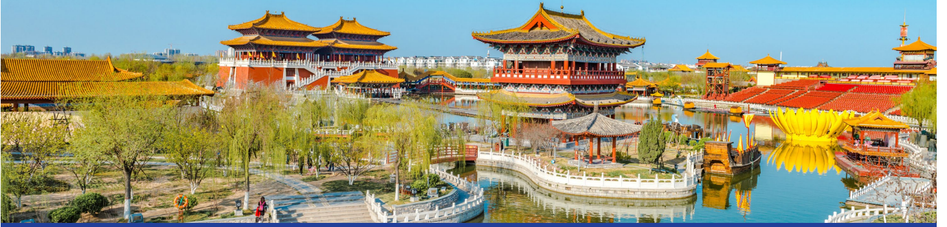
Qingming Riverside Landscape Park | 清明上河园