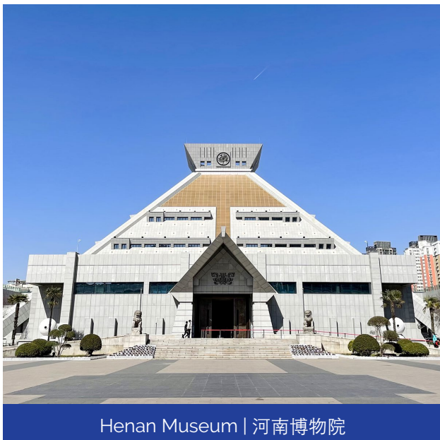
Henan Museum | 河南博物院