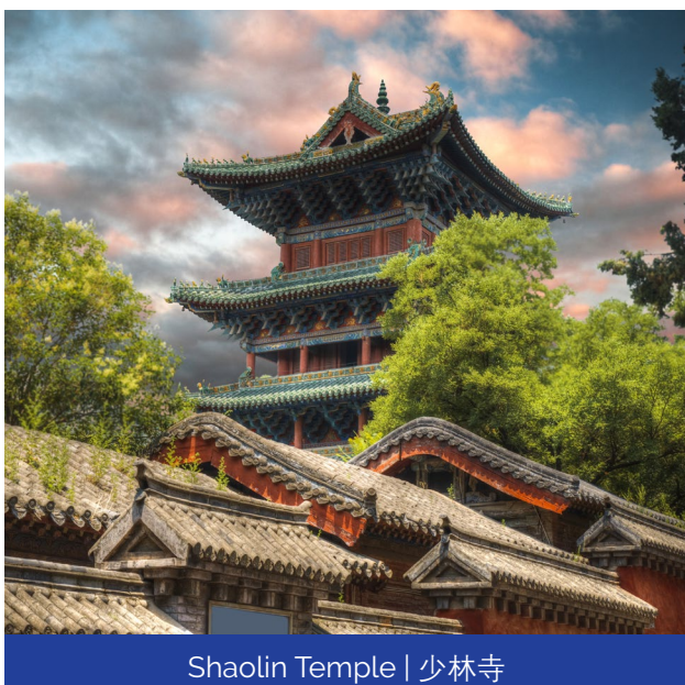
Shaolin Temple | 少林寺

Accommodation: Shaolin Center Inn or similar