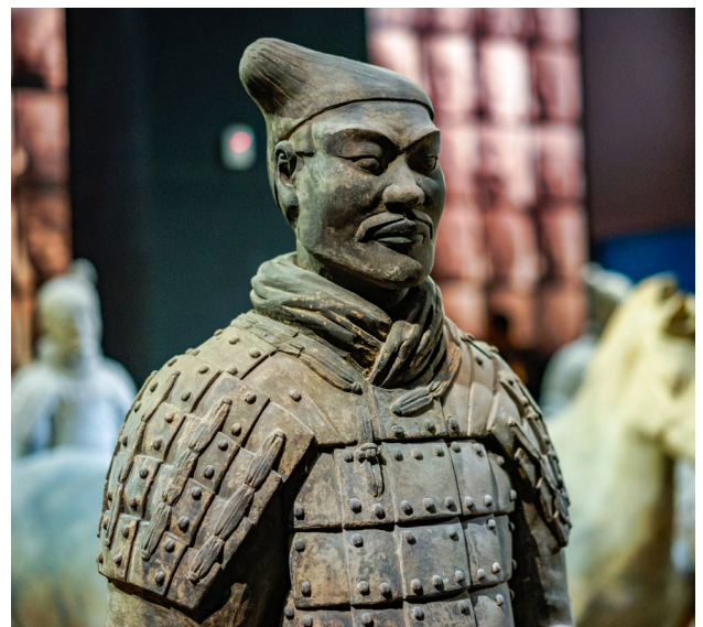
Terracotta Army | 兵马俑