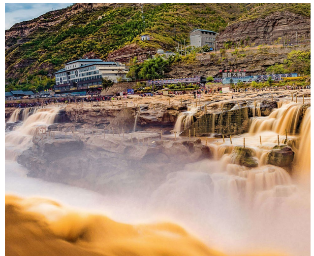
Hukou Waterfall Scenic Area | 黄河壶口瀑布风景名胜區