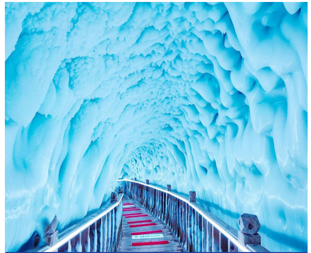
Yunqiu Mountain Ice Cave Group | 云丘山冰洞群